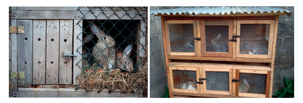
Figure 2: Rabbit houses constructed using local materials.

cages for rabbit commercially available in the study areas. Hungu et al. (2013) ascribed the poor design and construction of rabbit hutches to limited access to technical information and inadequate funds for purchasing construction materials by farmers.