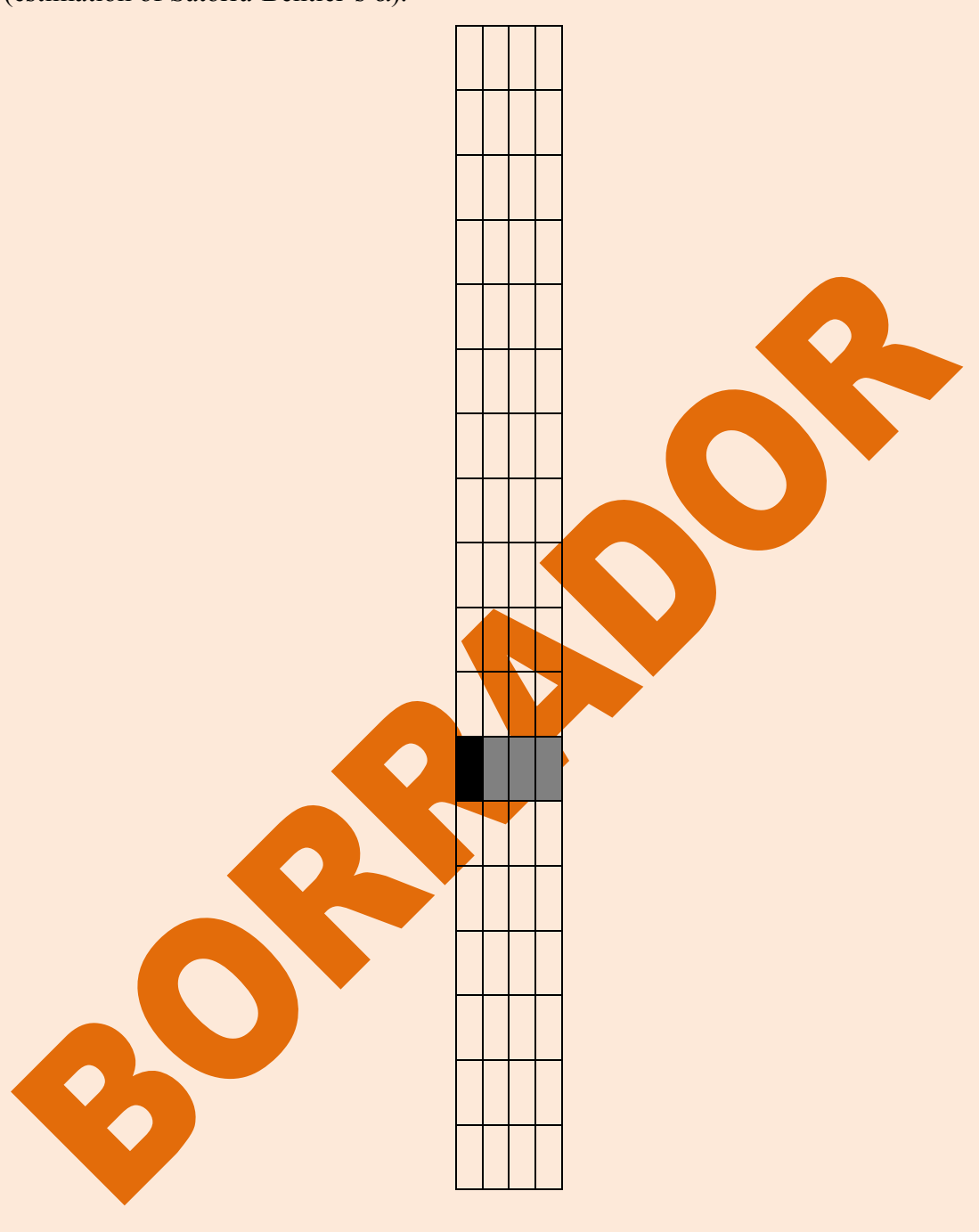
Table 3. Global fits for the different structural models with indication of reliability (estimation of Satorra-Bentler's \alpha ).