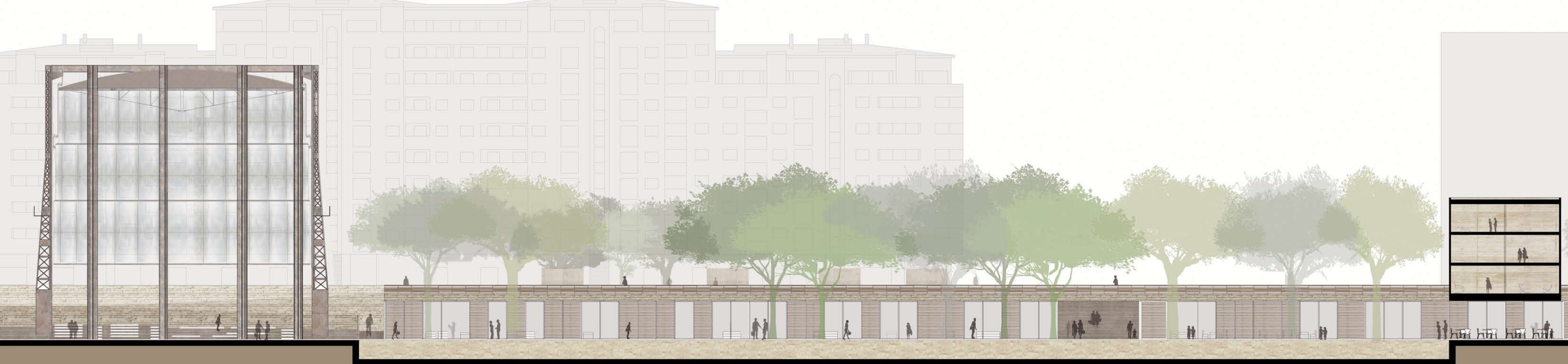
SECCIÓN LONGITUDINAL POR PATIO CENTRAL e: 1/200