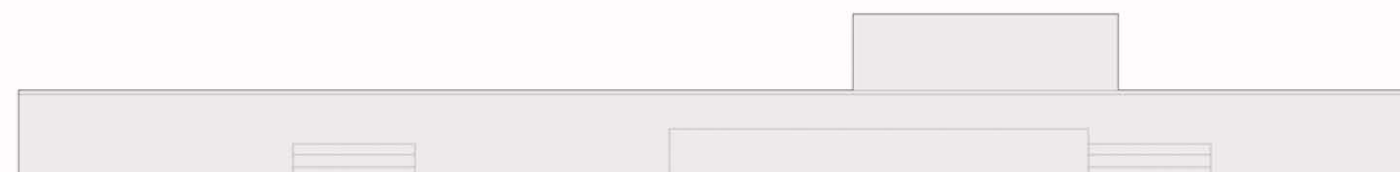
DETALLES CONSTRUCTIVOS e: 1/30