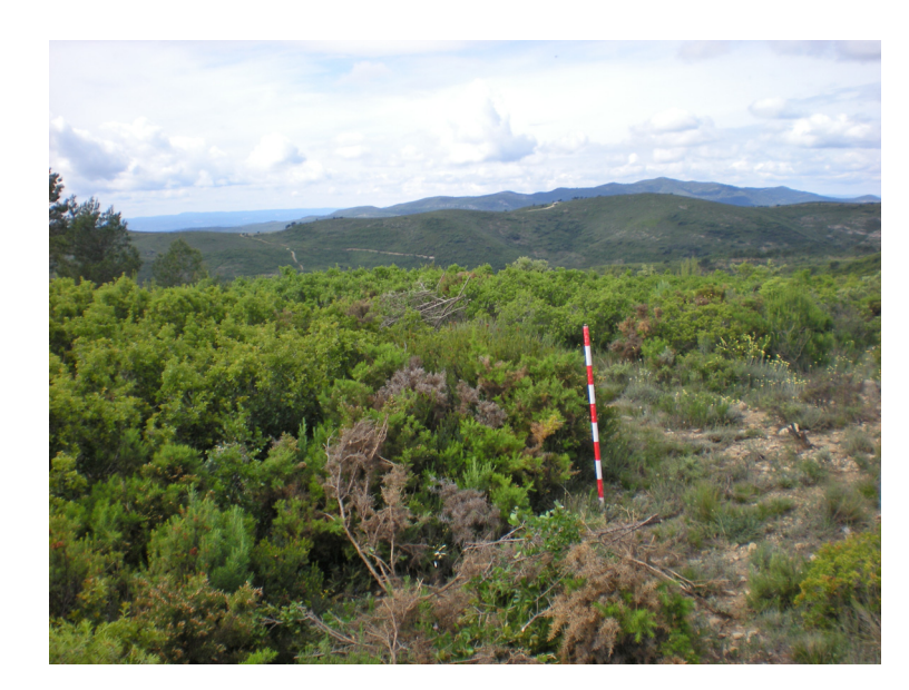
Fig. 2 Image of the study area showing a dense presence of kermes oak (Quercus coccifera).