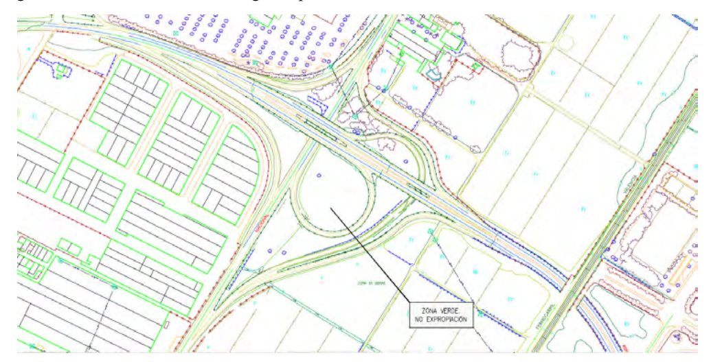
Figure 7: Expropriation map for the construction of a road in Castellon de la Plana (Spain)

When a project is materialized on the ground, the final result may present differences with the original drafting and this leads to future legal disputes. In such cases an expert report is necessary to adjust the original project, whether expropriation, urbanization, etc.., with the current state of the terrain. Figure 7 shows an expropriation map that was not correctly materialized on the ground and resulted in several legal disputes.