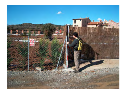
Figure 2: Field measurements of a fenced property in San Agustín (Teruel – Spain) taken with topographic instruments