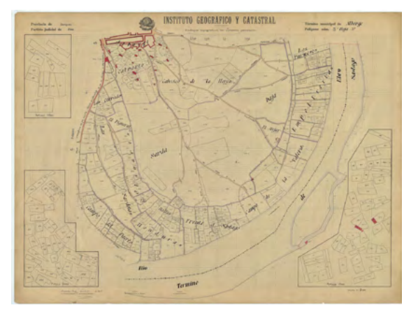
Figure 4: Old cadastral map, year 1928. Municipality of Alborge (Zaragoza - Spain)

- LAND SURVETORS AS EXPERT WITNESSES IN REAL ESTATELITICATION MATTERS IN SPAIN