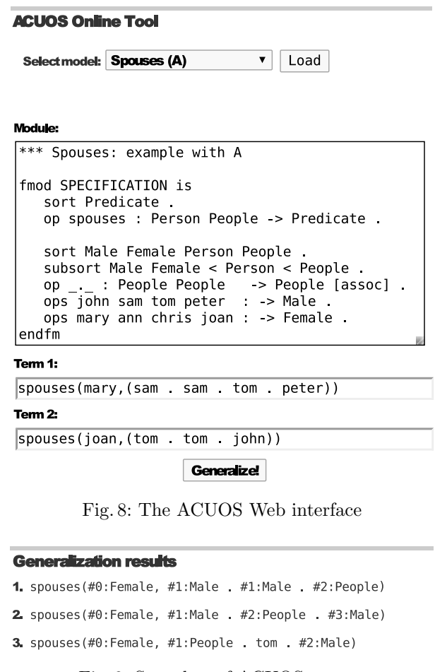
Fig. 9: Snapshot of ACUOS output

no generalizer for two terms (unlike the case of syntactical generalization, in the order-sorted setting the sorts of different kinds^6 are incompatible and then the terms of these sorts have no generalization, not even a variable); \omega when there is a finite number of elements in the equivalence classes of the generalizers; and \infty when the equivalence classes (w.r.t. \approx_{ACU} ) can have an infinite number of ACU-equivalent generalizers. Any combinations of the A and C axioms are in the \omega class. The introduction of the U axiom leads to size \infty (even if the number of ACU least general generalizers is still finite).