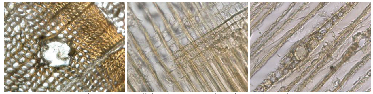
Fig. 5. Cross, radial and tangent section of a wood sample

In addition, 24 samples were collected to identify the timber used in the structure. Each sample had its cross, radial, and tangential section analysed through an optical microscope. It was found that all samples were Pinus nigra Arnold (Fig. 5.).