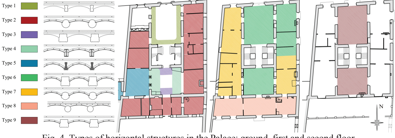
Fig. 4. Types of horizontal structures in the Palace: ground, first and second floor

On the second floor, only two structures were visible because the rest were hidden behind a false ceiling. These two ceilings correspond to Type 9 and have a section of 22 cm, a maximum length of 700 cm and a span of 43 and 49 cm.