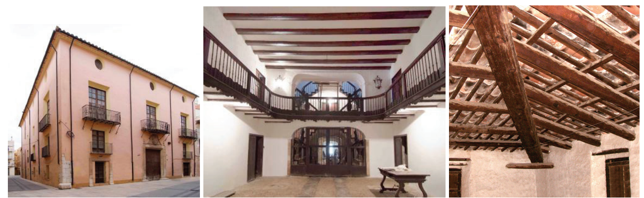
Fig. 1. Exterior of the palace

The palace changed its name during the history: the primitive gothic building, headquarters of the commander of the Order of Montesa, received the name of " Palacio de la Encomienda " (Palace of the Entrusting). Later, when Joaquín Miquel Lluís acquired the construction and build his palace on top, it received the name of " Casa dels Miquel " (House of the Miquels). Finally, when Juan Pérez San Millán y Miquel received the title of Marquees in 1905 the edifice received the name of " Palacio del Marqués " (Palace of the Marquees), name that is still used nowadays.