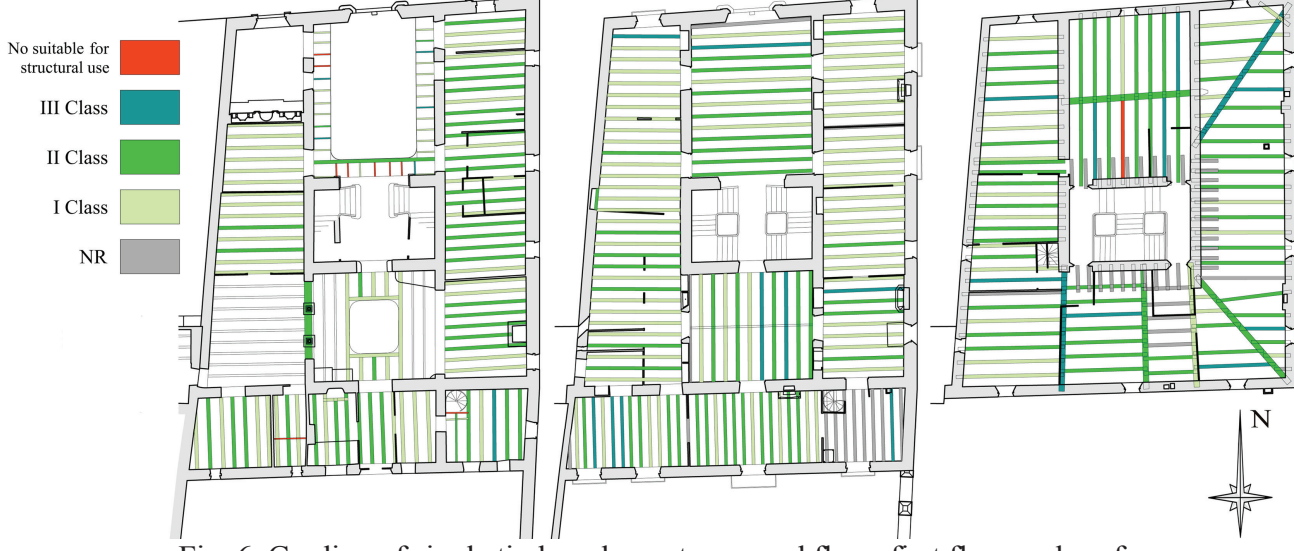
Fig. 6. Grading of single timber elements: ground floor, first floor and roof

Through the table: "Stresses and modules of elasticity for the on-site grades" of the Italian standard UNI 11119 cited in the previous chapter, it is possible to link the grading with the strength of the timber elements.