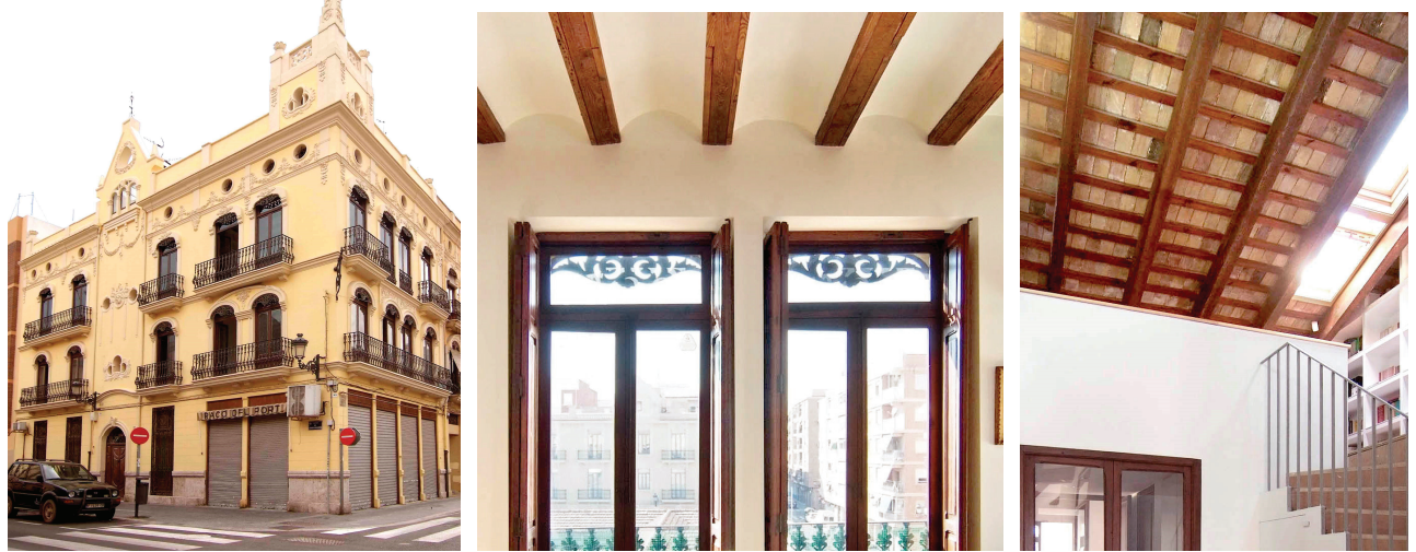
Fig. 5. Façade of the Art Nouveau building, jack arch floor, roof structure

The microscopic identification of the Southern Yellow Pine was done by analyzing a number of samples under the optical microscope, with the collaboration of Nicola Macchioni, researcher at CNR-IVALSA, Italy.