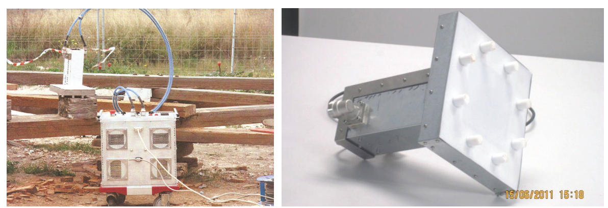
Fig. 2. Dryparasite device, antenna emitting microwaves

This system uses a device which components are: a special metal insulated box where 220 volt electric current is converted into 4000 volt by a transformer and microwaves are generated by a magnetron, a specially designed square antenna that reaches the element to be treated and special coaxial cables that connect the two elements (Fig. 2).