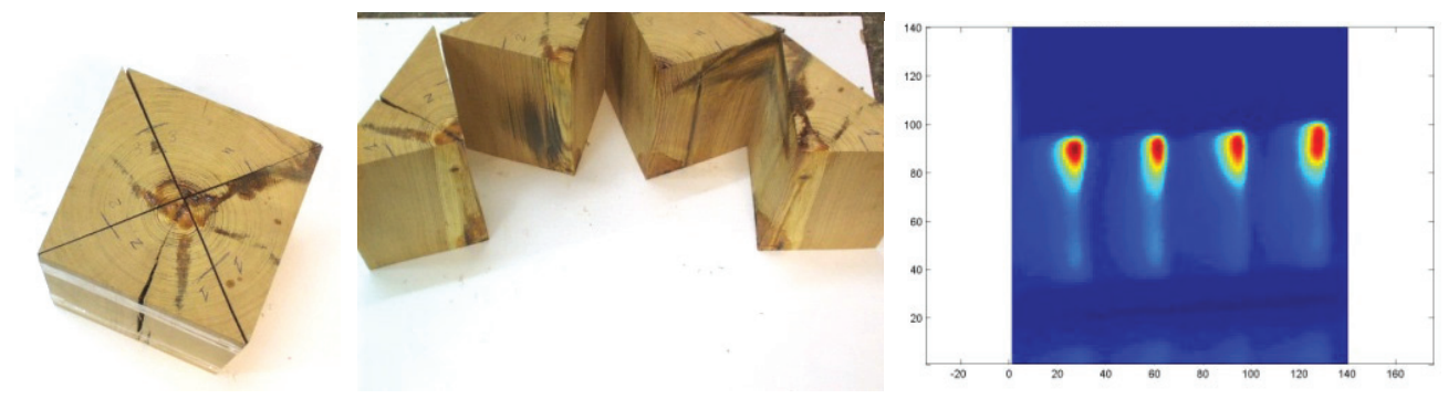
Fig. 4. Treated wood, sectioned element, thermographic image

In all the mentioned tests, the crucial point was the measurement of both interior and exterior temperature of wood. The information was gathered by using thermographic cameras and thermocouples so that the distribution of the microwaves inside the wood could be studied (Fig. 4).