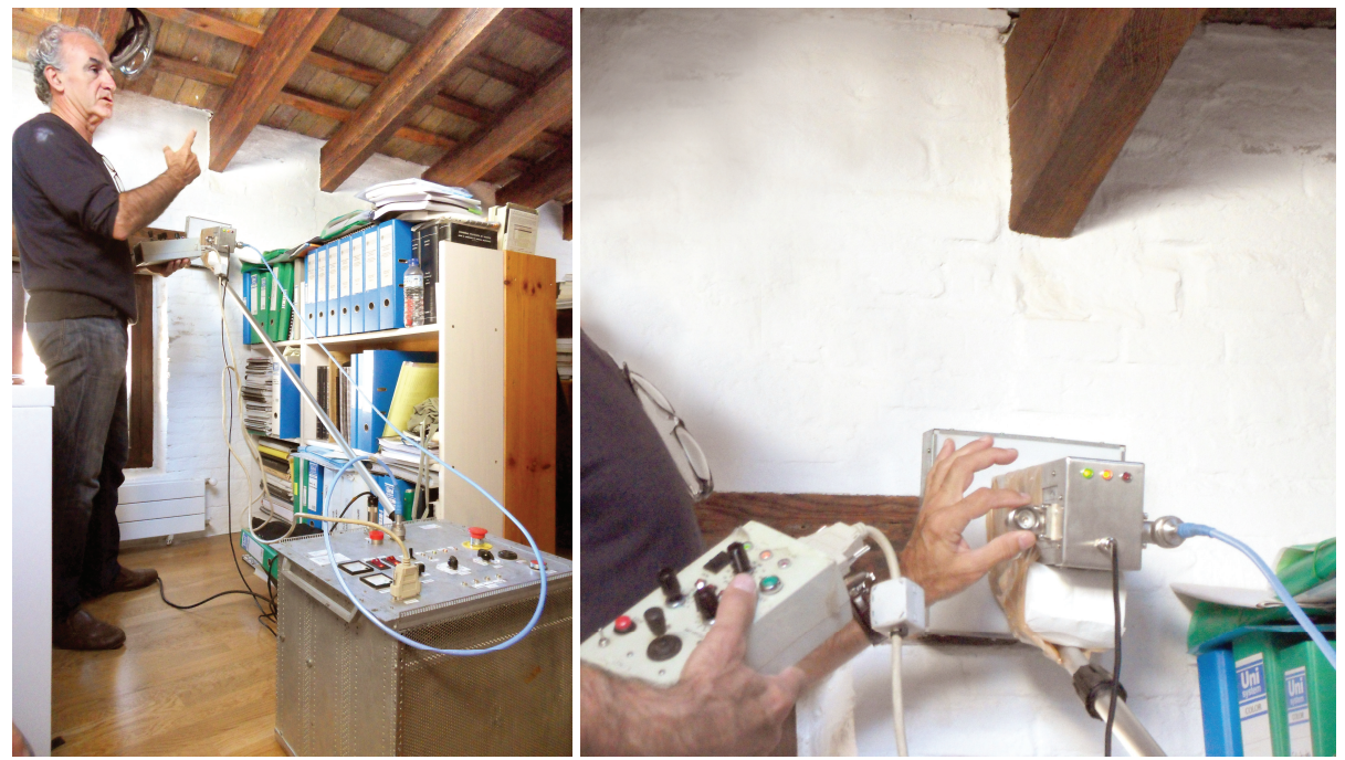
Fig. 7. Application of the microwave treatment on a timber lintel

Finally the treatment of the whole timber structure took two days and required the presence of one worker to program and control the machine.