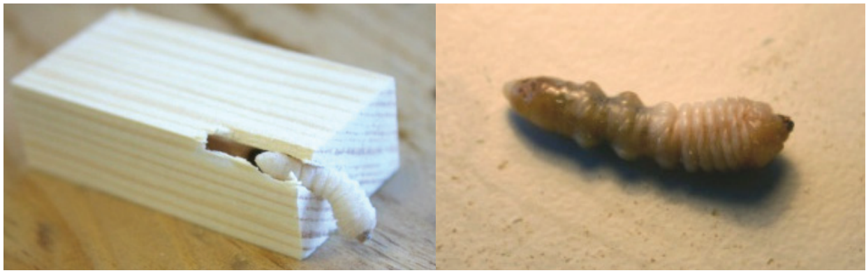
Fig. 1. Larva of a Hylotrupes bajulus before and after applying microwaves

As the moisture content in wood is usually around 12% while the presence of water in wood boring insects rises up to 90%, the heating effect of microwaves is especially concentrated on the insects. Therefore the temperature of the water inside the body of the insects rapidly increase provoking a sort of artificial fever, more than 60°C, until the animal cannot bear it anymore and dies (Fig. 1).