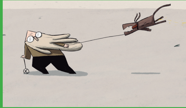
Fig. 7 – Wind (Robert Löbel, 2013). Grand Prix European student film, HAFF 2014.