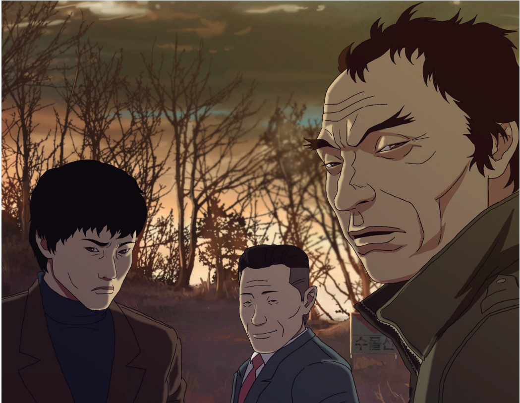
Fig. 5 – The Fake (Sang-ho Yeon, 2013). Grand Prix feature film, HAFF 2014.