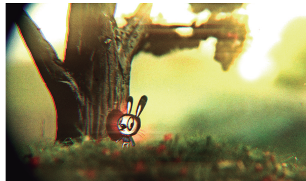
Fig. 6 – The Obvious Child (Stephen Irwin, 2013). Special mention short narrative, HAFF 2014.

Yes, but people should learn. Many filmmakers are only interested in making film. But I think production is also very important. How to produce a film. In addition, if they produce a film they are really involved in and understand production. As a student, they can do and decide everything. Later on, after graduation, if they want to make a film of 5 minutes, they have to find a producer to find the money. If you don't know anything about production, you may complain lot much about the