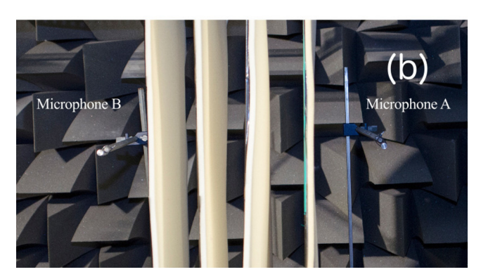
FIG. 2. (a) Experimental setup, consisting in an array of four plates of porous material; showing the source, a loudspeaker located in front of the structure, and the microphone to measure intensity at either side of the structure. (b) View of the system from a different angle.