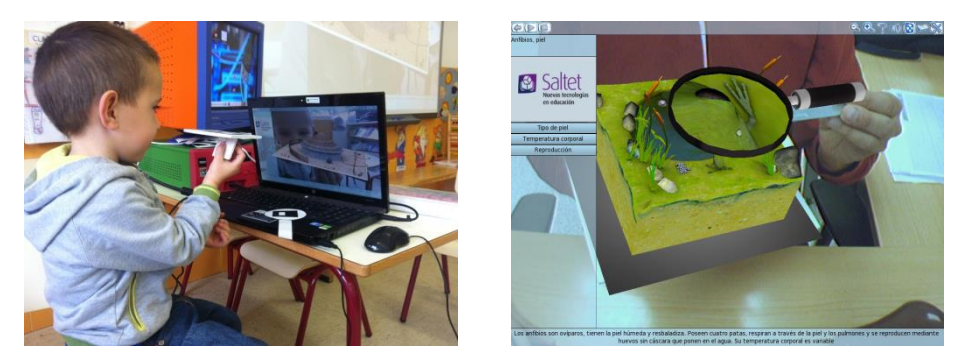
Fig. 3. (a) Preschooler using the AR application (b) Two marks interaction: magnifying glass

This AR application provides two activities, "Presentation" and "Lesson", and it includes an innovative solution in AR. That solution is a special magnifying glass, which will be described below. The main objective of this application is to help the teachers to show the students the vertebrate animal classification and to show in detail these animals' coats, kind of reproduction and corporal temperature. Thus, "Presentation" shows, over the AR marker, a kind of park where five animated couples of animals appear. This mode only allows the user to observe the scene; there is no more interaction than moving the AR marker and to observe the animals from different points of view.