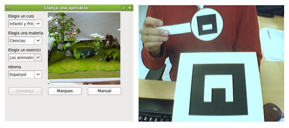
Fig. 1. (a) Launcher to run the AR animal application; (b) AR marks used by the application

The augmented reality application consists of a launcher, a camera configuration tool and a content installation tool. The launcher is designed to manage a collection of AR contents and it allows the user to launch a specific AR application, selecting its academic year, subject and language through pull-down menus as seen in figure 1-a. It also provides a preview of the content; a handbook about it and the AR marker which has to be printed in order to use the AR application (see figure 1-b).