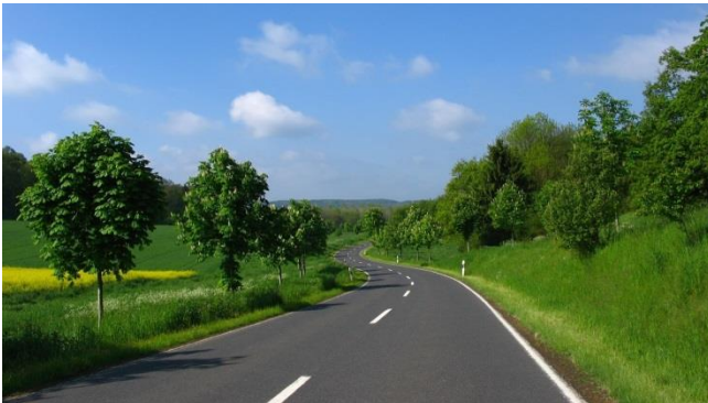
Fig 1. Example of Roads.

Transportation infrastructures are an important part of a country's assets; in addition, they are a key factor to achieve economic development, productivity improvement and social wellbeing (Uddin et al., 2013). Recent reports highlight its economic relevance; thus, more than 400 billion dollars are invested every year in the world in pavement construction and maintenance (IRF, 2010). From the environmental point of view, in the last years there has been an increased effort for the reduction and reuse of residues generated by the construction industry (Aldana & Serpell, 2012). As for road infrastructures, the biggest efforts have been focused on reducing vehicle emissions, at the expense of the impact generated in the stages of construction, use and maintenance. According to some studies, this impact increases by 10% the impact generated by vehicle operation (Chester & Horvath, 2009). This situation leads, inexorably, to a sustainable management of pavements, which deals with technical, economic, environmental, political and institutional criteria over their life-cycle. This view goes beyond the actions' immediate effect on these infrastructures (Chamorro, 2012; Chamorro & Tighe, 2009; SADC, 2003).