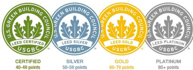
Fig 3. LEED certification system example.

These systems are based on the environmental certification of buildings, specifically on the LEED certification system ( Leadership in Energy and Environmental Design ), created by the U.S. Green Building Council in 1998. The building projects are rated according to different levels covering issues such as energy efficiency, use of alternative energies, improvement of indoor environmental quality, and others (Owensby-Conte & Yepes, 2012; Ramírez & Serpell, 2012). Concerning pavements, the indicator is a point-based rating system associated to a certification level similar to the one used in LEED (certified, silver, gold or platinum).