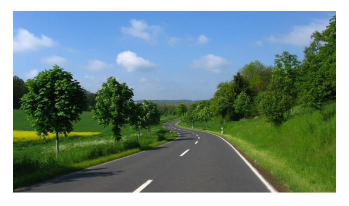
Fig 1. Example of Roads.

Transportation infrastructures are an important part of a country's assets; in addition, they are a key factor to achieve economic development, productivity improvement and social wellbeing (Uddin et al., 2013). Recent reports highlight its economic relevance; thus, more than 400 billion dollars are invested every year in the world in pavement construction and maintenance (IRF, 2010). From the environmental point of view, in the last years there has been an increased effort for the reduction and reuse of residues generated by the construction industry (Aldana & Serpell, 2012). As for road infrastructures, the biggest efforts have been focused on reducing vehicle emissions, at the expense of the impact generated in the stages of construction, use and maintenance. According to some studies, this impact increases by 10% the impact generated by vehicle operation (Chester & Horvath, 2009). This situation leads, inexorably, to a sustainable management of pavements, which deals with technical, economic, environmental, political and institutional criteria over their life-cycle. This view goes beyond the actions' immediate effect on these infrastructures (Chamorro, 2012; Chamorro & Tighe, 2009; SADC, 2003).