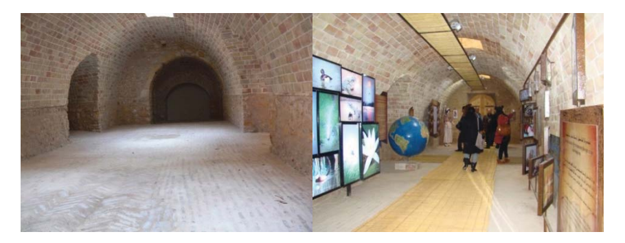
Figure 2: Tunisian Wetlands Room before and after the adaptation to modern use.

The interpretation centre is located in the opposite tower to the main entrance. The total available area for the exhibition is 227 m², divided into 2 main rooms of 100 m² each ('Tunisian Wetlands Room' and 'Ghar El Melh Room') plus a small space of 27 m² that hosts the visitor information point (fig. 2). These two large rooms house 14 exhibition stations that present the wetlands in Tunisia, including the related social and economic activities. There is also a 'Hall of Pirates', which traces the history of piracy in the region. A very easy sequential touring pattern has been established to avoid crowding and a minimal number of groups encountered (fig. 3).