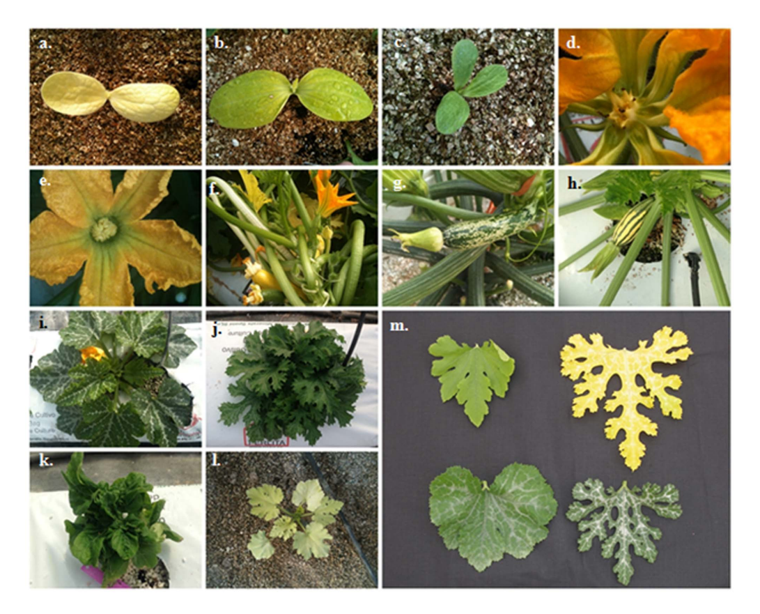
Figure 1. Examples of morphological mutants observed within the C. pepo TILLING population. (a) Plant affected in cotyledon colour, albino. (b) Plant affected in cotyledon colour, chlorotic. (c) Plant affected in cotyledon number. (d–e) Female flowers with abnormal stigma. (f–h) Different coloured fruits. (i–k) Semi-dwarf plants with bushy and hyper compact architecture. (l) Albino dwarf plant. (m) Different size and colour leaves.