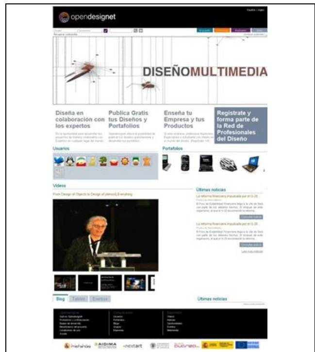
Figure 2. Main page OpenDesigNet interface

The collaborative design workshop area allows a user to create and manage design projects from the platform by using a collaborative on-line work environment to assist users in developing the documentation required during each phase of conceptualising a new product.