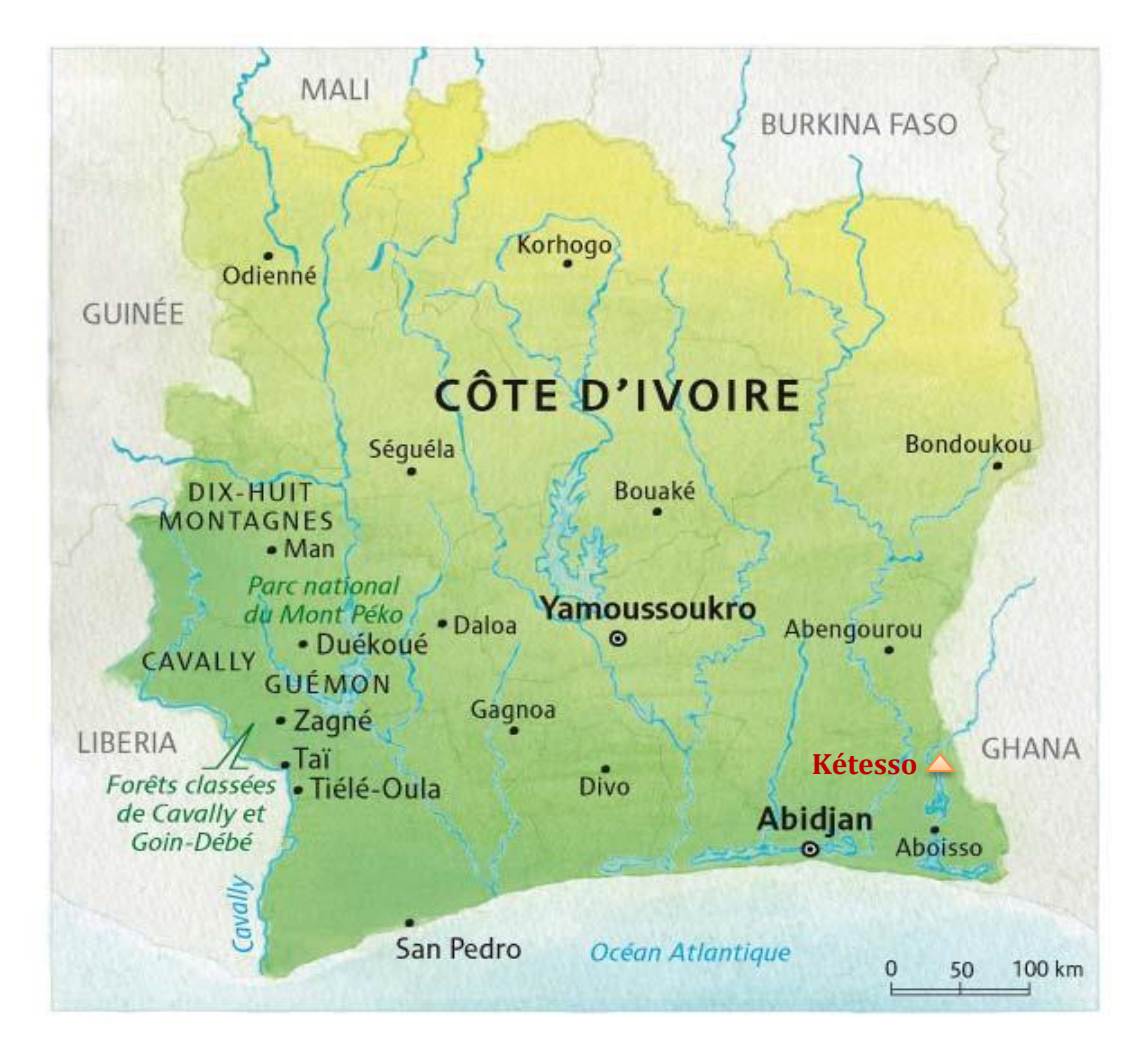
Figure 1 : location of the study area, in Kétesso (Côte d'Ivoire)