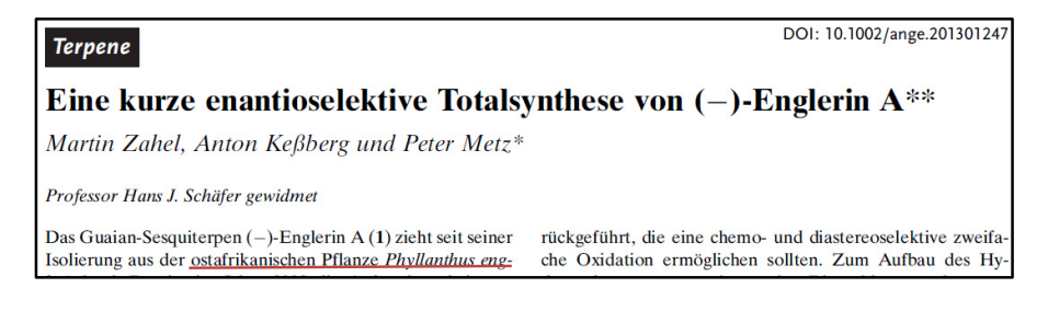
Fig. 2: Example of the need for careful reading of the text to identify SLUs: terpenes of vegetable origin.

In the case of terpenes we had to carefully read the paper to determine whether they were produced by animals, micro-organisms or vegetables. Most belonged to the vegetable world.