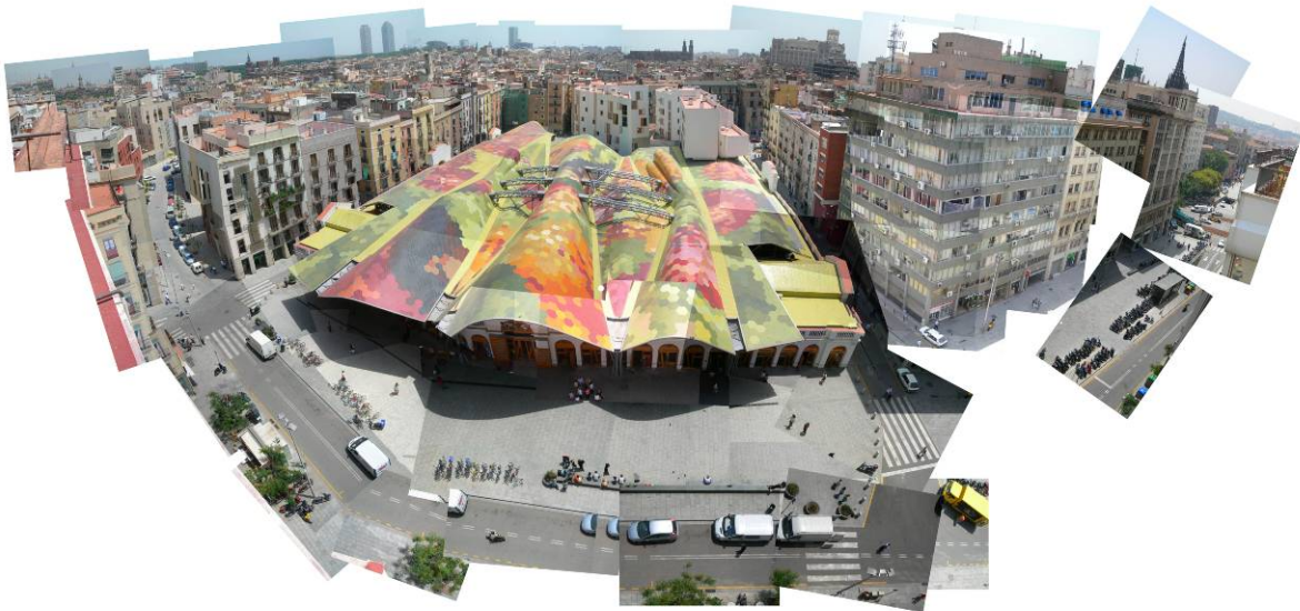
Figure 5: Top of the roof – Santa Caterina market, Enric Miralles and Benedetta Tagliabue, Barcelona, 2005 [Photo courtesy: EMBT architects].

The composition of the colours of the roof was obtained from the image of a market food stall after a digital treatment was used to reduce the colour information. The result of this abstraction process enabled a reduction to 64 colours and so facilitated the laying of ceramic tiles and their industrial treatment (as shown in Figures 6 and 7). Red and orange shades prevail over a large background with green ranges, enhanced by a simultaneous contrast between complementary colours that brings more vibrancy to the set. The bluish colours are almost nonexistent, although there are violet hues in the darker shades (in the same way impressionists painters used these colours to ‘cool’ the shadows). Every tile has a glossy finish that reflects sunlight and gives even more visual variety to the structure as daylight advances.