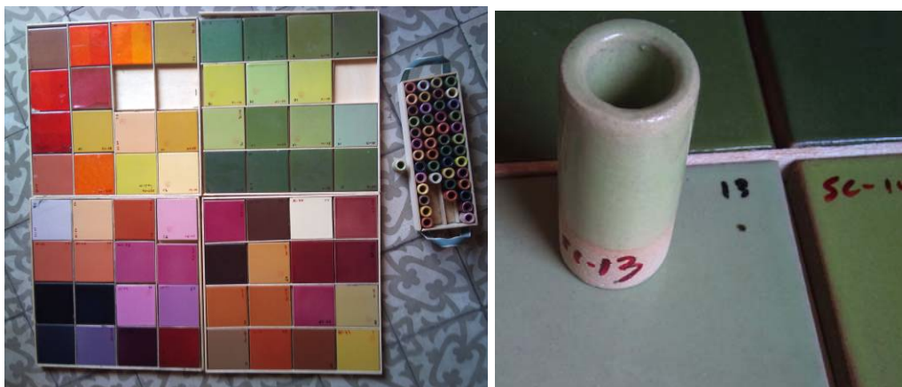
Figure 6 (left): Small samples of coloured glass tiles, showing the 64 shades selected.

The composition of the colours of the roof was obtained from the image of a market food stall after a digital treatment was used to reduce the colour information. The result of this abstraction process enabled a reduction to 64 colours and so facilitated the laying of ceramic tiles and their industrial treatment (as shown in Figures 6 and 7). Red and orange shades prevail over a large background with green ranges, enhanced by a simultaneous contrast between complementary colours that brings more vibrancy to the set. The bluish colours are almost nonexistent, although there are violet hues in the darker shades (in the same way impressionists painters used these colours to ‘cool’ the shadows). Every tile has a glossy finish that reflects sunlight and gives even more visual variety to the structure as daylight advances.