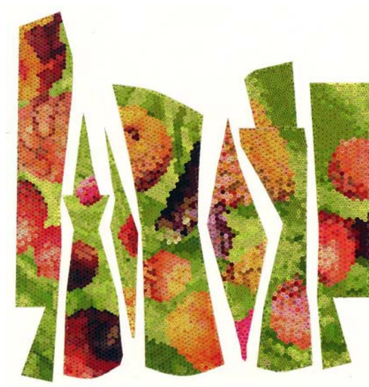
Figure 8: Final colour composition showing the distribution of small hexagonal tiles on the roof [Photo courtesy: EMBT architects].

Santa Caterina market follows this symbolic or abstract tradition of reducing the colours of reality to arrange them in buildings, as mentioned before with regard to modernist architecture in Valencia. There are many examples in contemporary architecture that use pixilated photographs in their composition.