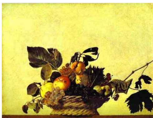
Figure 12: Still life, Caravaggio, 1596 [reproduced from

At times, it seems that the new structure will not be able to contain the moving roof, a new fifth facade that overlooks the building like a Phoenix , separated from the walls and then falling back towards the street as an awning [4]. The building stays loyal to the true owners of the building – the neighbours who walk by outside. As Miralles explains, ‘the market is for the people and the street, and it belongs to them’ [2].