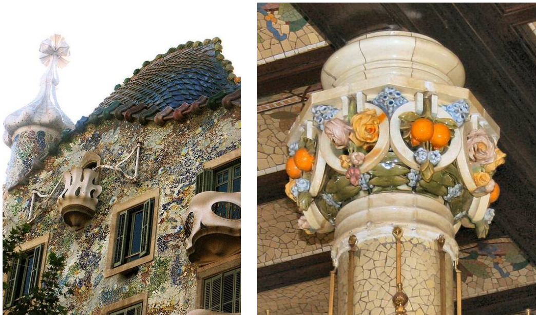
Figure 1 (left): Casa Batlló, Antoni Gaudí, Barcelona, 1904-1906.

We can distinguish two different tendencies: abstract or symbolic (characterised by the transfer of natural colours to the decoration of buildings, but without keeping the shapes of the original organic sources); and mimetic (characterised by the direct adoption of both colour and natural shapes in ornamental features).