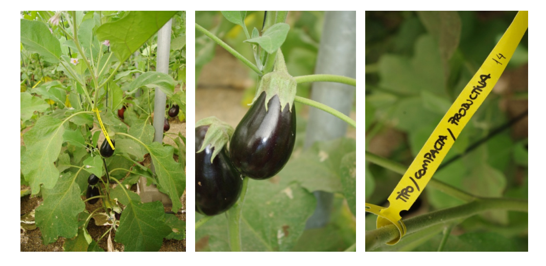
Fig. 3. One example of selected line, with a morphotype similar to the desired ideotype, and the way of tagging the plant.

From the selfed progenies of each F1 hybrid, genealogical selection was performed using the target traits and selecting only those plants