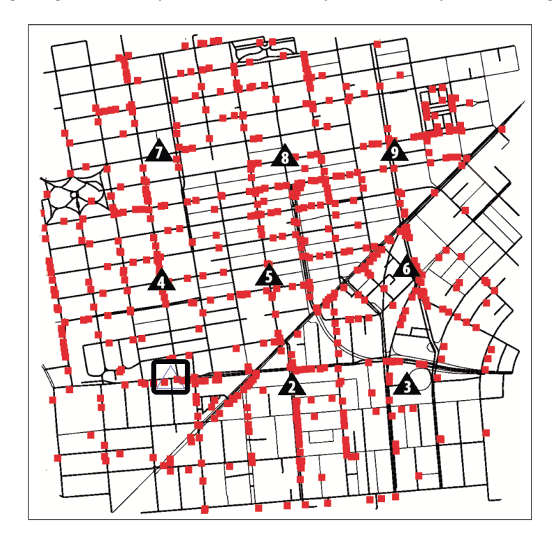
Figure 4. RSUs and vehicle locations in San Francisco when the simulation finished. In this example, RSU 1 is damaged.

To demonstrate the validity of our method, we repeated the experiment presented in Section 5.2, but now considering that RSU 1 presents some problems with respect to estimating the density in its area, thus affecting the global density estimation made by the V2I subsystem (see Figure 4).