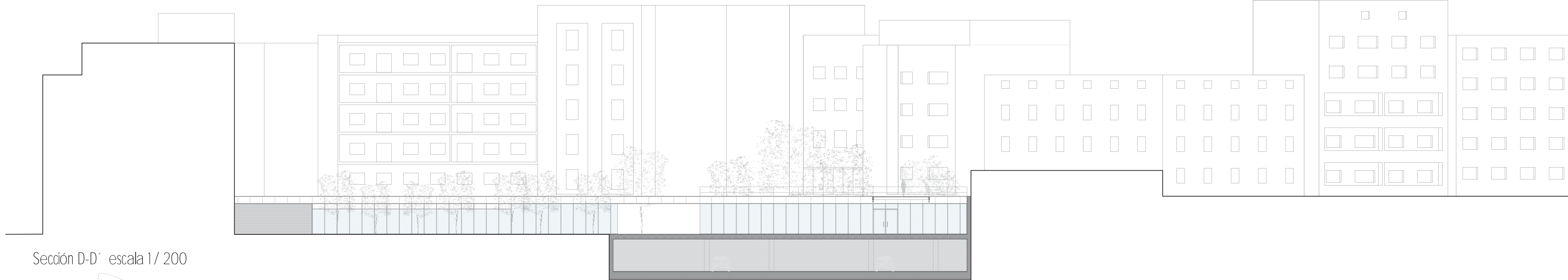
Sección D-D' escala 1/ 200