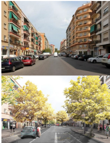
Figure 1: Main Pedestrian Route (IPP_02) along Ramiro de Maeztu Street (Valencia). Present situation and urban design below. Valencia SUMP, 2013.

The aim is to set finished and continuous walkways, able to connect different neighborhoods, and serve as burgeoning passages for existing commercial areas. Complementarily, the action looks at specific neighborhoods for creating neighborhood axes as reinforcing centrality elements, where progressively through-traffic is moved to back streets leaving free space for public gardens, play grounds and other amenities.