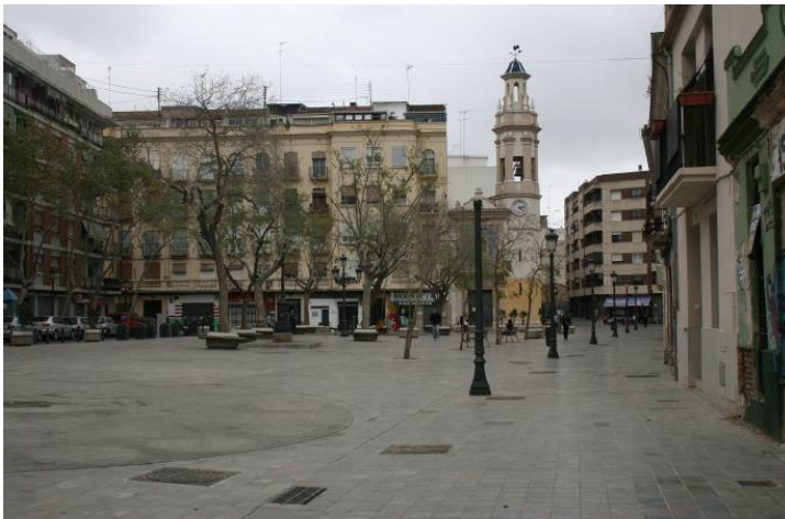
Figure 5: Works for increasing pedestrian areas in Valencia old districts. Patraix Square, 2012.

The areas of special preservation for its heritage character, as the surroundings of the Silk Market, World Heritage Monument, Central Market, Town Hall Square and Queen Square, are marked as priority interventions of full pedestrianization.