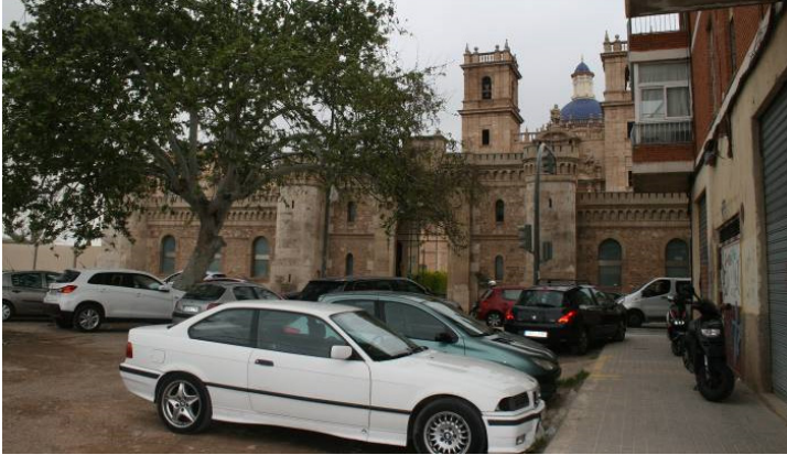
Figure 4: Monastery of San Miguel de los Reyes (Valencia), example of heritage site without a good pedestrian access.

Besides, the purpose of the previous study was to evaluate the possible interest of including cultural heritage elements in the layout of the pedestrian network and ponder whether it constitutes a real attraction for a pedestrian.