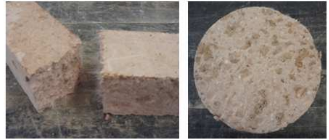
Fig.1. Samples N°5, With PBO Fibres+Cork +Red Gypsum Mortar

Contrary, wool provides significant improvement, particularly in terms of compression and elasticity. Furthermore, this material is 100% ecological and whose cost is significantly lower than that of the artificial fibres previously indicated.