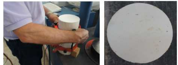
Fig.2. Samples N°10, With Alamo Gypsum