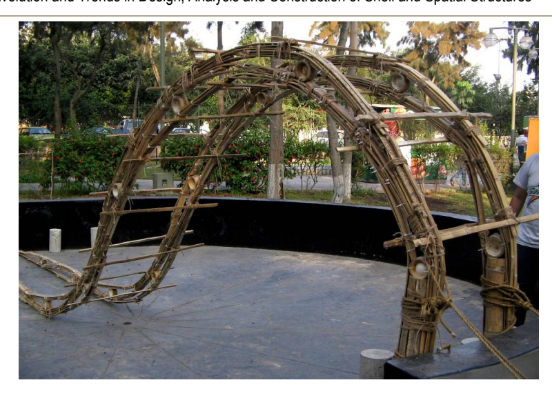
Figure 5. Bambú-flex Arch.

Model of test Arch Bambú - flex, constructed in the Ricardo Palma University, Faculty of Architecture and Urbanism, Lima - Perú.