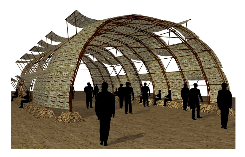
Figure 3. Bambú-flex Hangar.

Let's sense beforehand prototypes that depart from the formal adaptability of the Unit (arch).