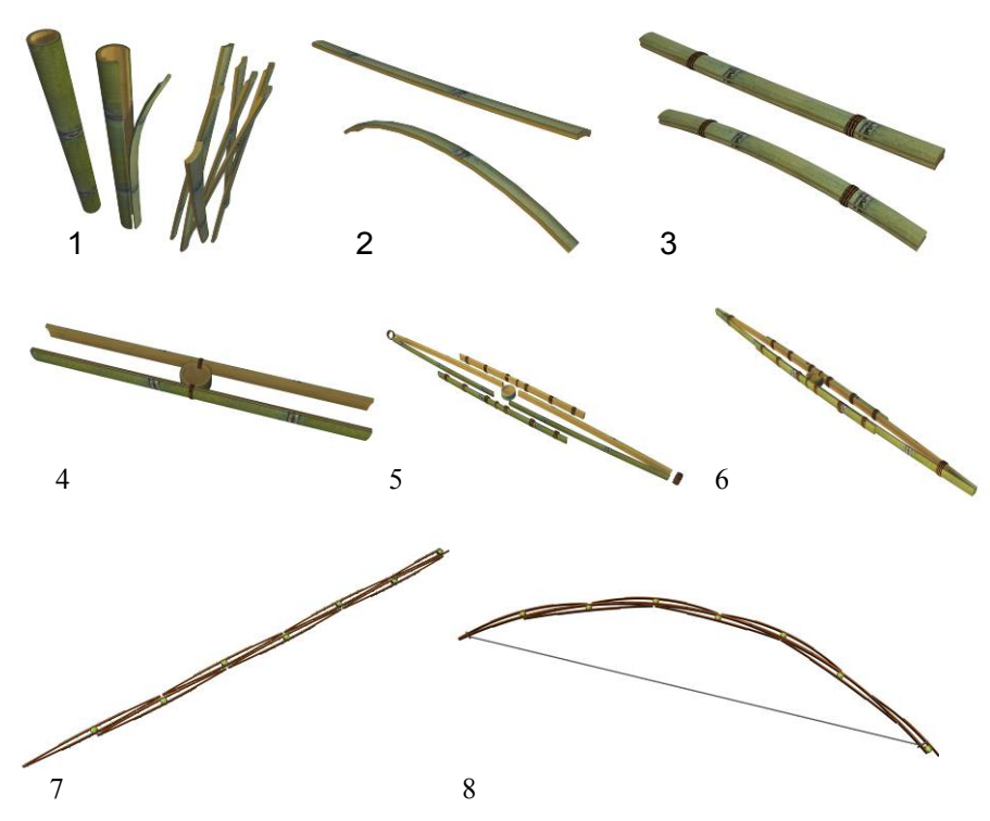
Figure 2. Digital Modulation: Sequence – Bamboo-flex Mechanism.