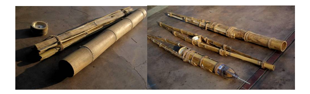
Figure 1. Analogue Modulation: Diaphragms section, laminated sections and rolled sections and (left) The generatrix Unit (The identity) and possibilities (right) – Bamboo-flex Mechanism.

From the overlapping traslation of assembly indentities in a shaft, archs are organized on three to more identities. The arch becomes the generatrix unit that traslated and /or rotated generates many possibilities, and finally acquires the stability and rigidity through the corresponding bracing between the established units.