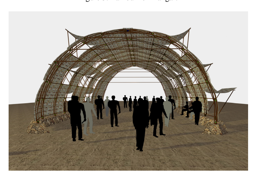
Figure 4. Bambú-flex Hangar.

First Place, in the Tenso-Estructures Student Competition, organized by the III Simposio Latinoamericano de Tenso Estructuras (SLTE) and the IASS, in Octubre, 2008 / Acapulco — México, Destined to be a Communal Center.