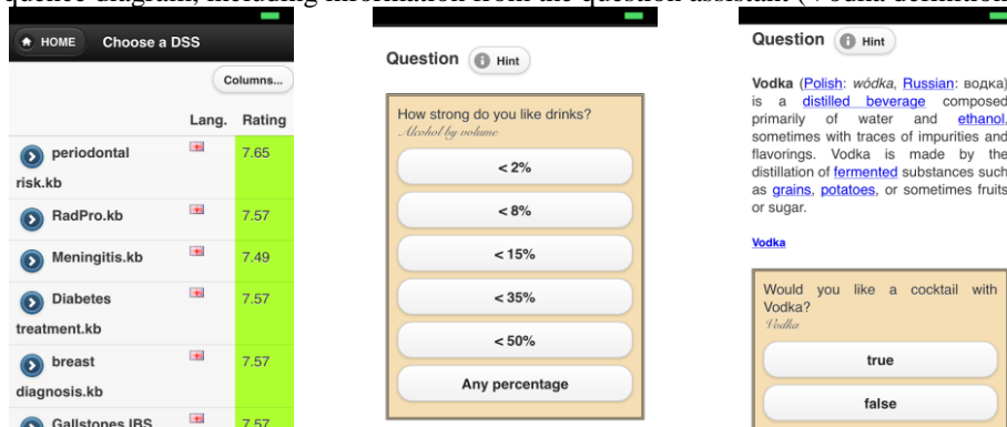
Fig. 3. Mobile Web User Interface for the application

Fig. 3 shows several snippets of the user interface, in particular obtained from a mobile phone access to the service. The first one shows the selection screen, in which a DBWS can be chosen. Next screens show questions 1 and 3 from the previous sequence diagram, including information from the question assistant (Vodka definition).