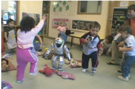
Fig. 6. Children dancing with QRIO (extracted from [24])

Another advantage of using robots is that they can move. Therefore, they can be used to enhance physical development. QRIO [24] is a humanoid robot introduced in a toddlers' classroom to make the kids move and dance, hence encouraging physical exercise. The robot would dance autonomously to the music (see Fig. 6) and react to the movements of a dancing partner (i.e. to his/her hand movements or clapping).