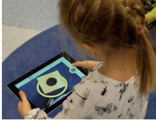
Fig. 2. Child interacting with CamQuest (extracted from [3]).

On the other hand, other studies have focused on the use of tabletops with educational purposes. For example, Yu et al [28] present a set of applications for children aged between 5 and 6 years. The applications contribute to the development of intelligence, linguistic, logical, mathematical, musical and visual-spatial aspects with activities such as listening a word and picking out the picture that represents it; shooting balloons with the right numbers, etc. Following the same research path, Khandelwal & Mazalek [11] have shown that this technology can be used by pre-kindergarten children to solve mathematical problems. The work of Mansor et al [12] conducts a comparison of a physical setting versus a tabletop collaborative setting with children aged between 3 and 4 years and suggests that children should remain standing during these operations because, otherwise, they find it difficult to drag objects on the surface due to bad postures.