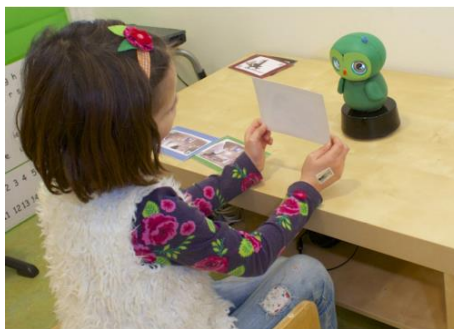
Fig. 4. A girl playing with an owl-shaped robot to foster language skills (extracted from [21])

Also aimed at improving language and literacy skills, Soute and Nijmeijer [21] design an owl-shaped robot to perform story-telling games with children aged 4 to 6. This robot (see Fig. 4) narrates a partial story which the students must complete showing some flashcards to it. A small study is also conducted during a game session and the results show the system is engaging for the kids.