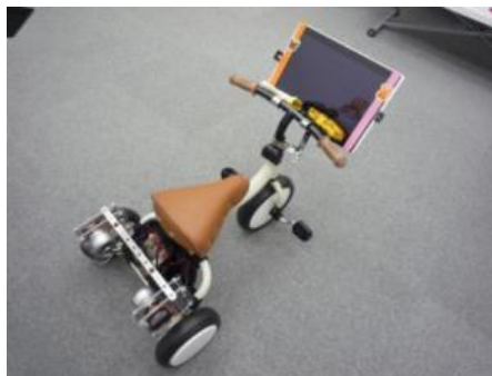
Fig. 5. Tricycle interface (extracted from [26])

Besides training linguistic abilities, other robots could also be used to develop spatial capabilities. For example, Tanaka and Takahashi [26] design a tangible interface for kids aged 3 to 6 in the form of a tricycle (see Fig. 5) to remotely control a robot. The movements performed on the tricycle (i.e., forward, backward, left, right) are mapped to movements of the tele-operated robot. Although not specifically built for this purpose, in our opinion this kind of interface could be used to stimulate spatial mappings on kindergarten children.