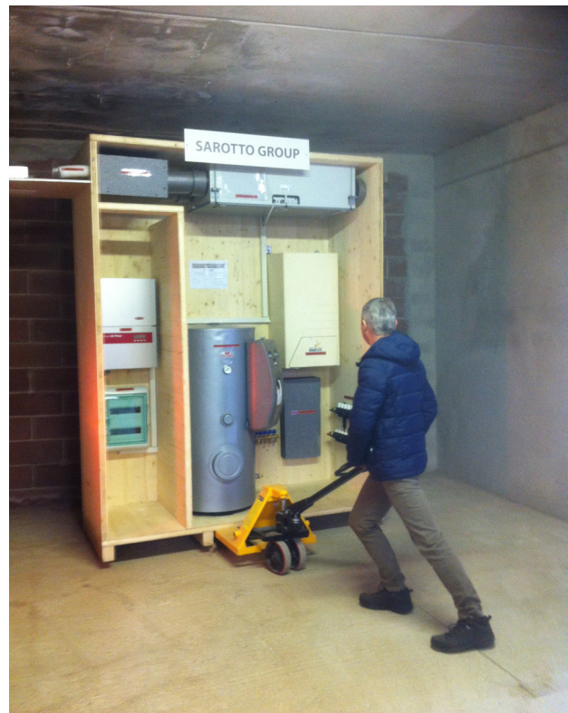
Figure 5. The MOTE2 mock up handling after the service cupboard assembling.

The service cupboard - once will be available for the construction market - might be included among the cutting-edge integrated building services. The last phase of the research was focused to point out the MOTE 2 's value proposition. MOTE 2 can be stand out