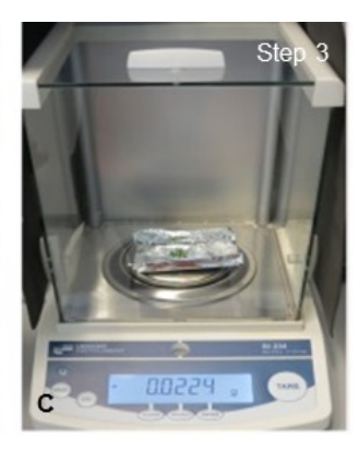
Figure 2. View of plant fresh weight measurements. A) Plantlets are carefully removed from the medium and B-C) weighed with a precision balance.