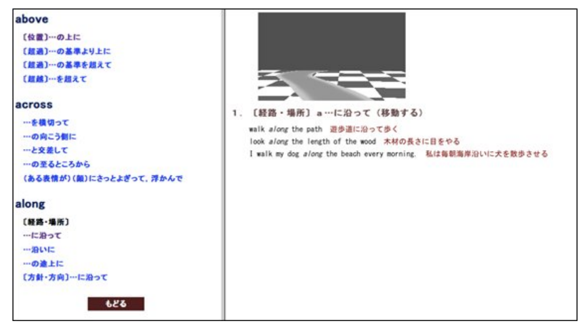
Figure 3. Web-based dictionary with 3D visual gloss.