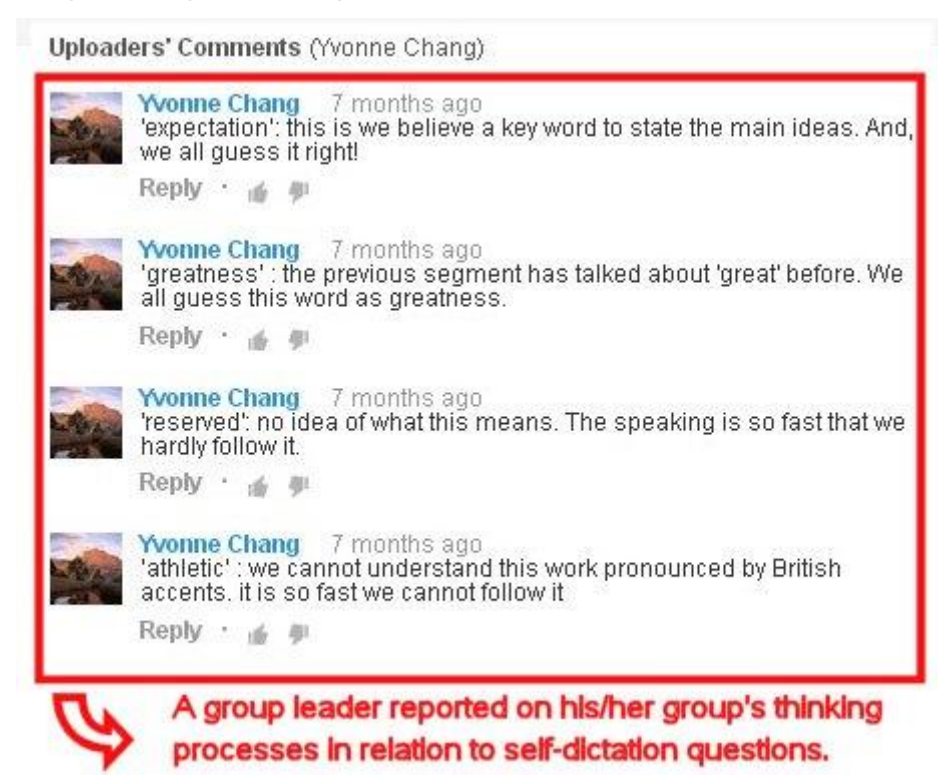
Figure 2. An example of group reflections in the YouTube comments area.

and had made inferences about it from a previous video segment on greatness. They thus proposed using a prediction from a previous video segment to assist them with guessing the correct word and inferring the main topic of the video context. Throughout the monitoring processes, self-regulated learning was expected to elicit information on whether students were using appropriate listening strategies to accomplish the activity. The implementation of the online-SDG learning activity from the YouTube platform was expected to activate a dynamic and mixed practice of metacognition strategy at different stages during the activity.