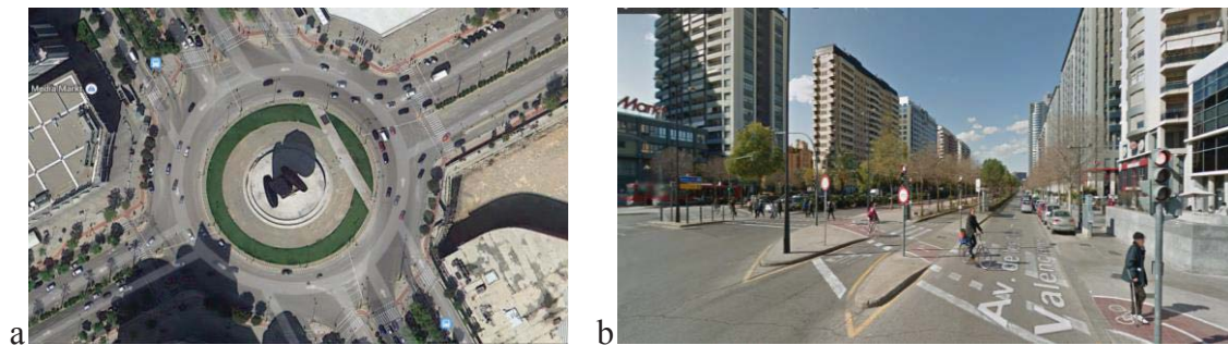
Figure 4. Roundabout in Valencia. Figure 4a. Aerial view of the roundabout: in NW direction, Avenida de las Cortes Valencianas (111 m wide, 7 traffic lanes in each direction), in NE direction, Carrer de la Safor (70 m wide, 5 traffic lanes in each direction). Figure 4b. NW section of Avenida de las Cortes Valencianas.

When shown two pictures of different roundabouts in FG2, one participant pointed to an example of a large roundabout in Valencia he had to cross recently (Figure 4). Many participants agreed with him on the difficulty of crossing it. They referred to a high intersection density with a poor coordination among adjacent traffic signals.