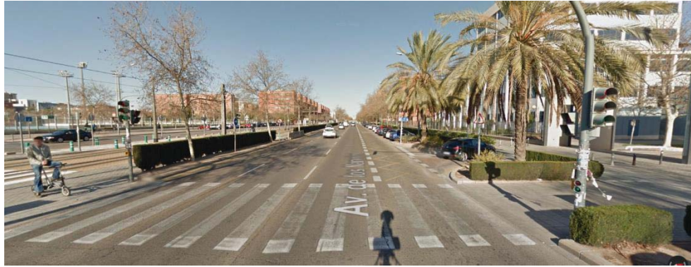
Figure 2- Photograph of Avenida de los Naranjos: it has a section of 70 meters, with 4 traffic lanes in each direction and a tram lane in the middle.

Additionally, the street width was reported by a lot of participants. Some of them appreciated “narrow streets” but not “too narrow”. Others referred to wide streets as pleasant. However, some respondents considered unpleasant “too wide avenues”.