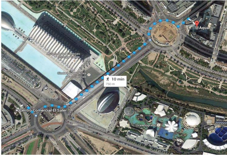
Figure 3- Aerial view of the walking route between two malls in the city of Valencia. Google Maps estimates it is a 10 min walk (750 m long).