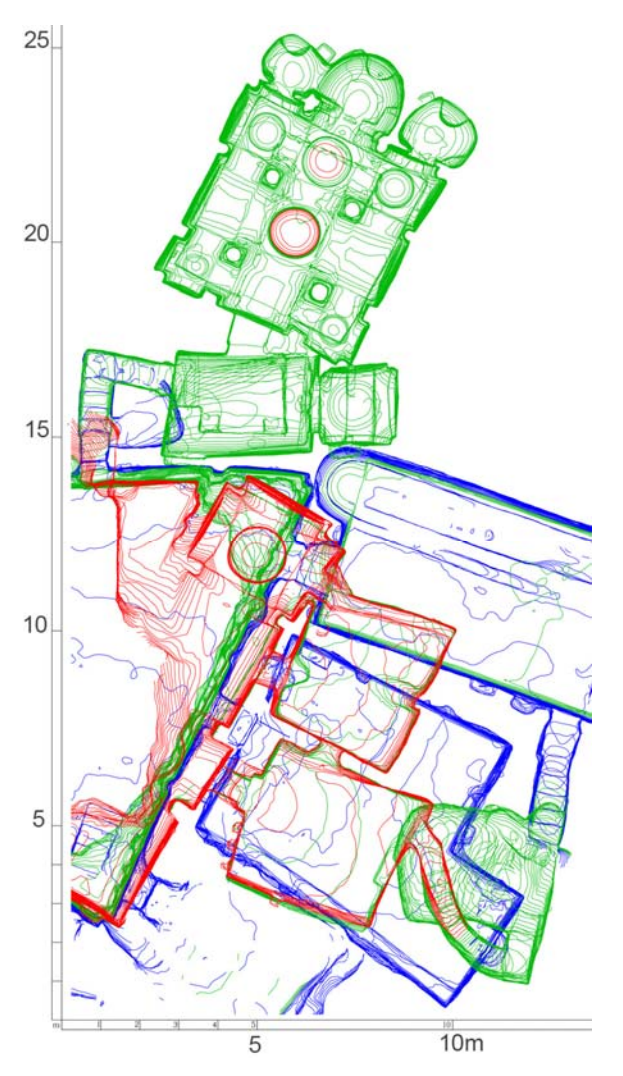
Figure 2: General plan, detail: lower level in blue; middle level in green; upper level in red. Karanlik Monastery