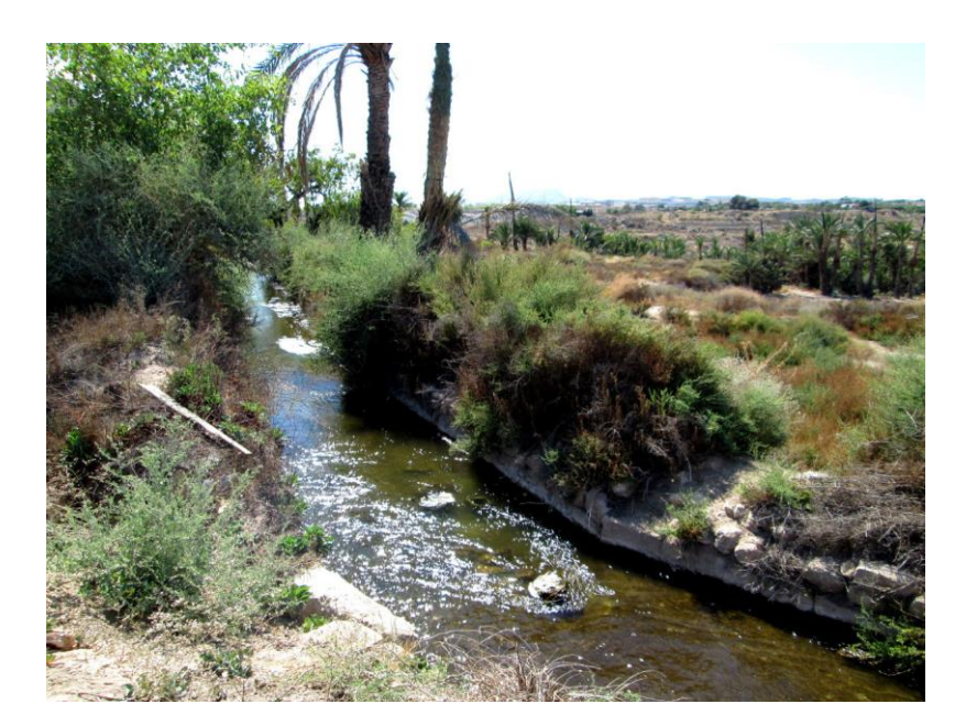
Fig.5: The Sequia Major arriving at its first divider, Albinella. 2013