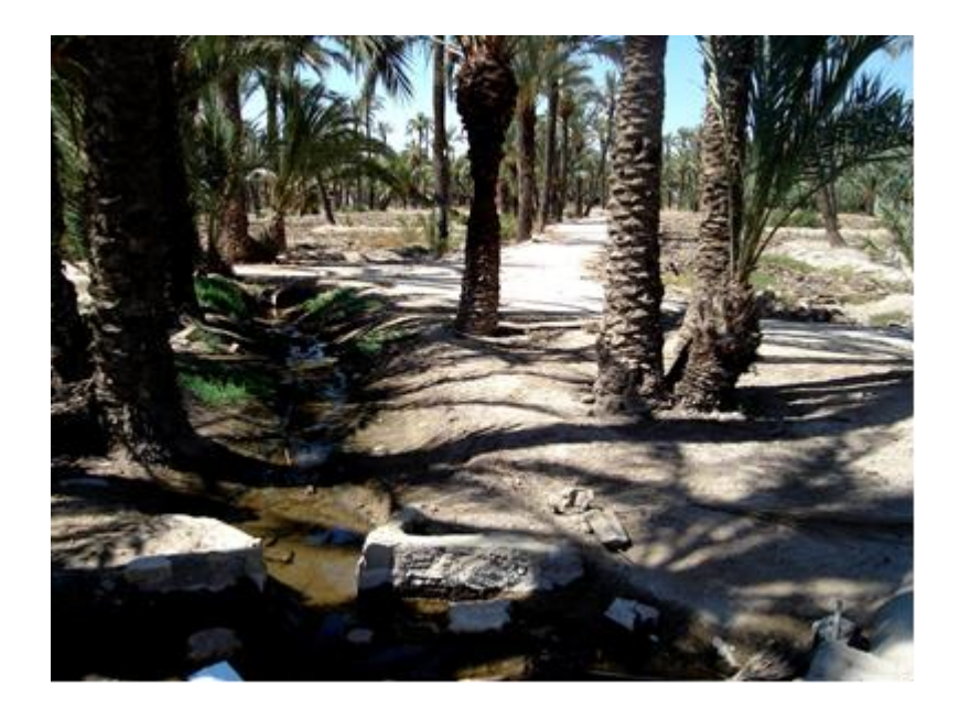
Fig.2. Orchard, Historical Palmeral, Elche. 2007