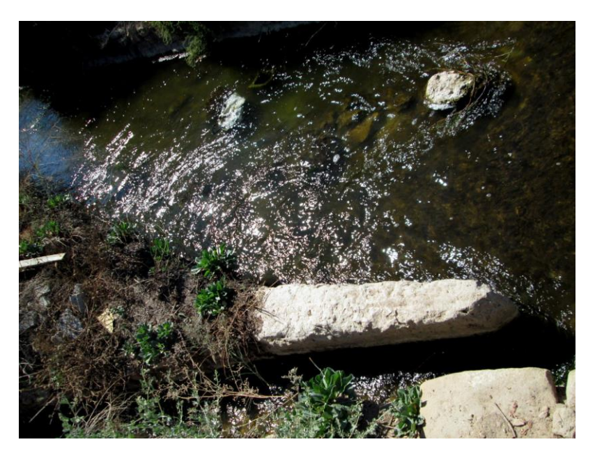
Fig.6: Divider of Albinella. Photograph by D. Aviñó. 2013