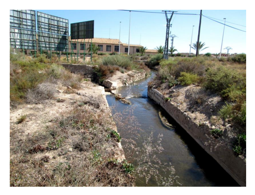
Fig.7: The Séquia Major arriving at the divider of Carrell. 2013

The divider of Aladia-Franch occupies a key position in the whole system, and despite having been traditionally considered a later addition, the truth is that its measures correspond quite accurately to the rassasi cubit of 53 cm. The water distributed by Aladia-Franch belonged to the Infante Don Manuel, separately administered, as shown by the existence of another "book of waters" known as the "Llibre Xic" (De Hidalgo, 1851).