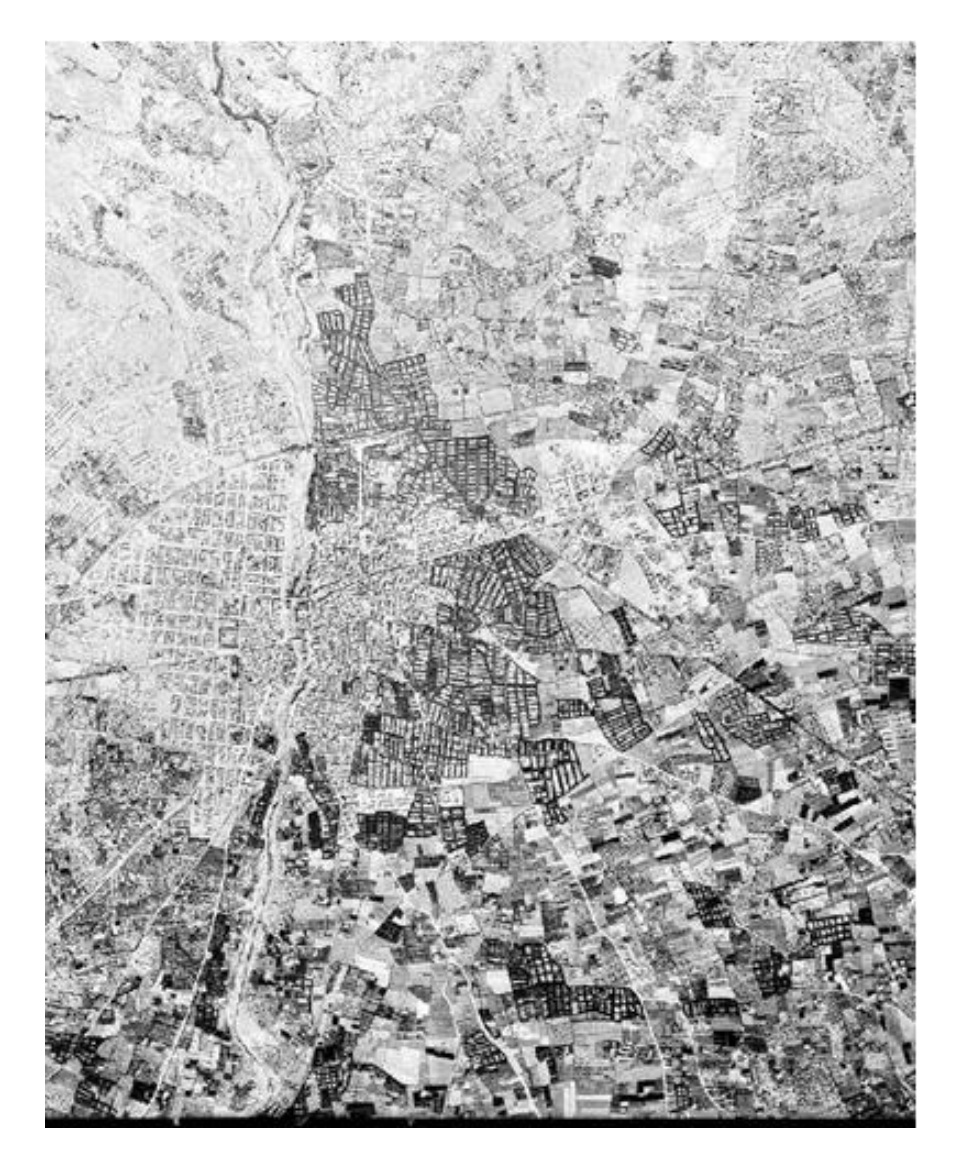
Fig.1. Aerial view of Elche and its irrigation area. Ruiz de Alda, military flight, 1929.