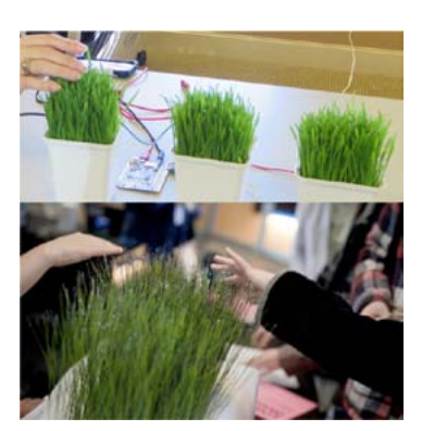
Fig. 1. Real Grass (Top) and Fiber Optic Grass (Bottom)

described as a "neurological disease of essentially demonic cause" by Johannes Hoffer, the Swiss doctor who coined the term in 1688. Military physicians speculated that its prevalence among Swiss mercenaries abroad was due to earlier damage to the soldiers' ear drums and brain cells by the unremitting clanging of cowbells in the Alps. Nostalgia has been shown to counteract loneliness, boredom and anxiety. It makes people more generous to strangers and more tolerant of outsiders. Couples feel closer and look happier when they're sharing nostalgic memories. On cold days, or in cold rooms, people use nostalgia to literally feel warmer. Grass was created to evoke pleasant memories of the life from tangible interaction with real and artificial grass pots.