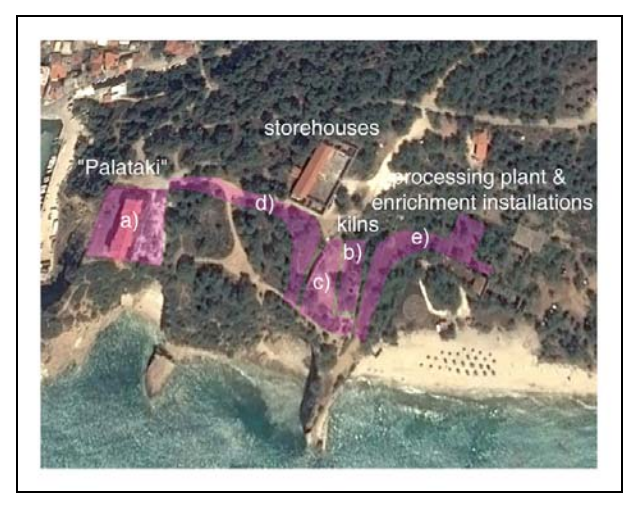
Figure 5: The selected buildings and sites to be scanned.

The selection of buildings and site to be scanned was made on the basis of two factors: (i) the importance and the state of risk of each building, and (ii) the duration of the Workshop (six days). Thus, the selected buildings and sites (Fig. 5) to be scanned were as follows: (a) "Palataki" and the kilns (furnaces), (b) the platform above the kilns, (c) the road that connects "Palataki" and the platform, (d) the road that connects kilns (furnaces), and (e) the factory (processing plant and enrichment installations). Initially, the area around "Palataki" and the kilns was cleaned and a bunch of trees was removed in order to capture the selected buildings.