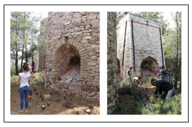
Figure 4: The kilns during vegetation removal.