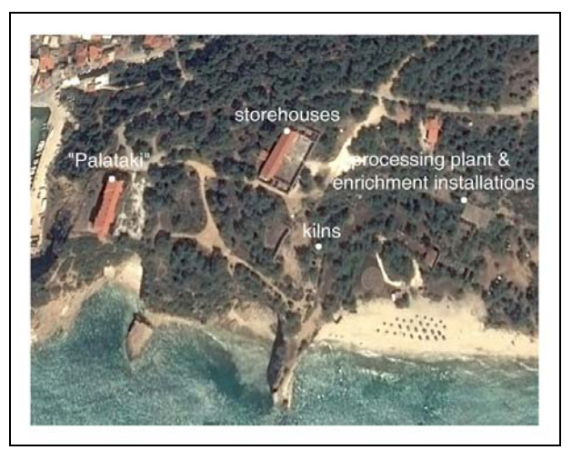
Figure 2: Map of the mining complex of Limenaria (Source: Google Earth).

In the early 20th century, mining companies such as "Speidel-Pforzeheim" (1905-1912) and "Veille Montagne & Société Hellenique Metallurgique et Miniere" (1925-1930) exploited the island's Zinc-lead rich calamine ores. In 1905 a metallurgical plant was erected at Limenaria, the second largest town of the island, for the calcination of the calamines in vertical and Oxland furnaces to produce ZnO. Later (1926) the calcination plant was rebuilt by Vieille Montagne with Waelz system rotary furnaces. Iron ore mining became important during the years 1954-1964. Several mining companies (Schmidt-Krupp and Apostolopoulos A.E., Chondrodimos S.A.) exploited the iron ore deposits of the island. It is estimated that total mineral production during the period 1905-1964 was about 2 million tonnes of calamine (12% Zn+Pb) and 3 million tonnes of iron ore (44% Fe). Since 1964 there has been no mining activity on the island.