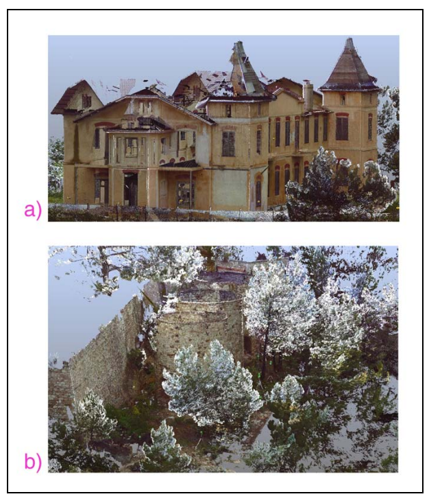
Figure 7: The colored point cloud of "Palataki" (a) and the kilns (b).

the whole area scanned. The finalized "noise-free' model consisted of 5 billion points.