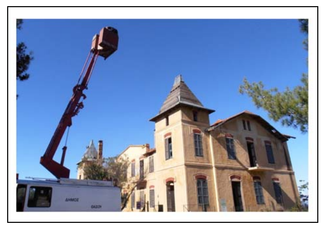
Figure 3: "Palataki" during data acquisition process.

later by its successor "Veille Montagne" (Fig. 4). After the 1930s recession, ore-processing was stopped and the great furnace-ramp was used only for hauling unprocessed ore to barges. Several other buildings complete the set of installations around the Limenaria area.