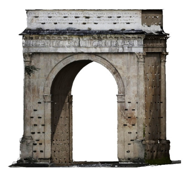
Figure 1: Integrated photogrammetical and laser scanning model of the Arch of Augustus.

The Arch of Augustus is the imposing and very well preserved monument describing this particular moment. The arch arose in the year 8 B.C., as a testimony of the agreement arranged between the Celtic king named Cozio and Emperor Augustus. (Fig. 1)