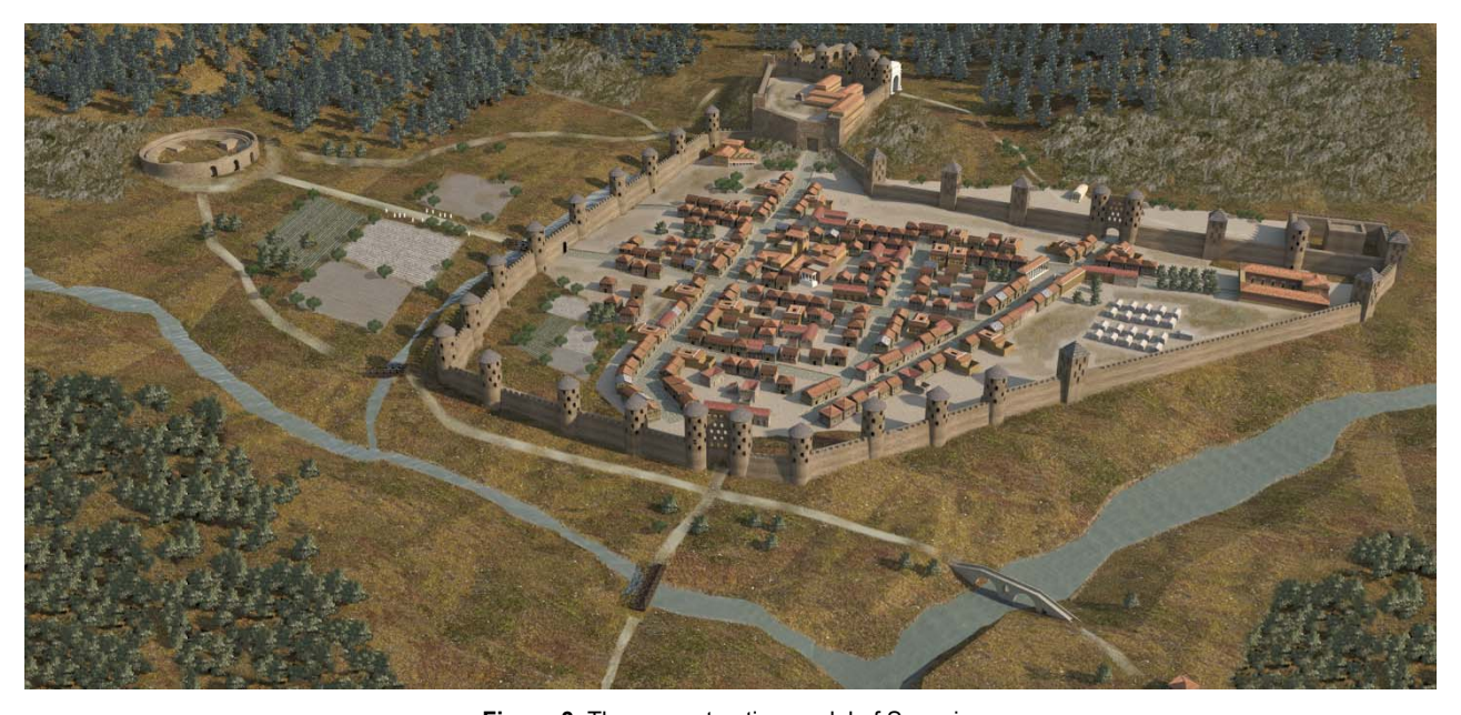
\textbf{Figure 3} : \ \, \textbf{The reconstructive model of Segusio}.

The use of the results of historical research, as well as those of the non-standard photogrammetric surveys (UAV) and terrestrial laser scanning (TLS), the management of geographic information in GIS and even virtual reconstruction tools (Maya – Autodesk) have made possible to coordinate the pieces of certain knowledge and and those hypothesized in a single "picture" of the whole city.