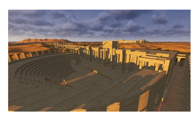
Figure 4: Reconstructed view of the Amphitheater.