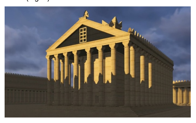
Figure 1: Reconstructed view of the Temple of Bel while sun is setting.

Corinthean order. Alongside overall Classical Graeco-Roman appearance, it also embodied prominent Near Eastern motives. The most visible of them were the windows of cella. These windows which did not exist in the Greco-Roman cannon signified that the Deity was inside (Fig. 2).