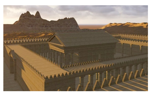
Figure 2: Reconstructed outer-view of the Temple of Baalshamin and its environment.