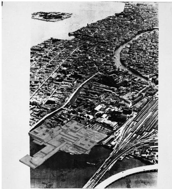
2. Romano Chirivi and collaborators, Project for the new Civic Hospital (competition submission) , AP-riproduzioni/fot/015/12, Archivio Progetti Iuav, Venice.