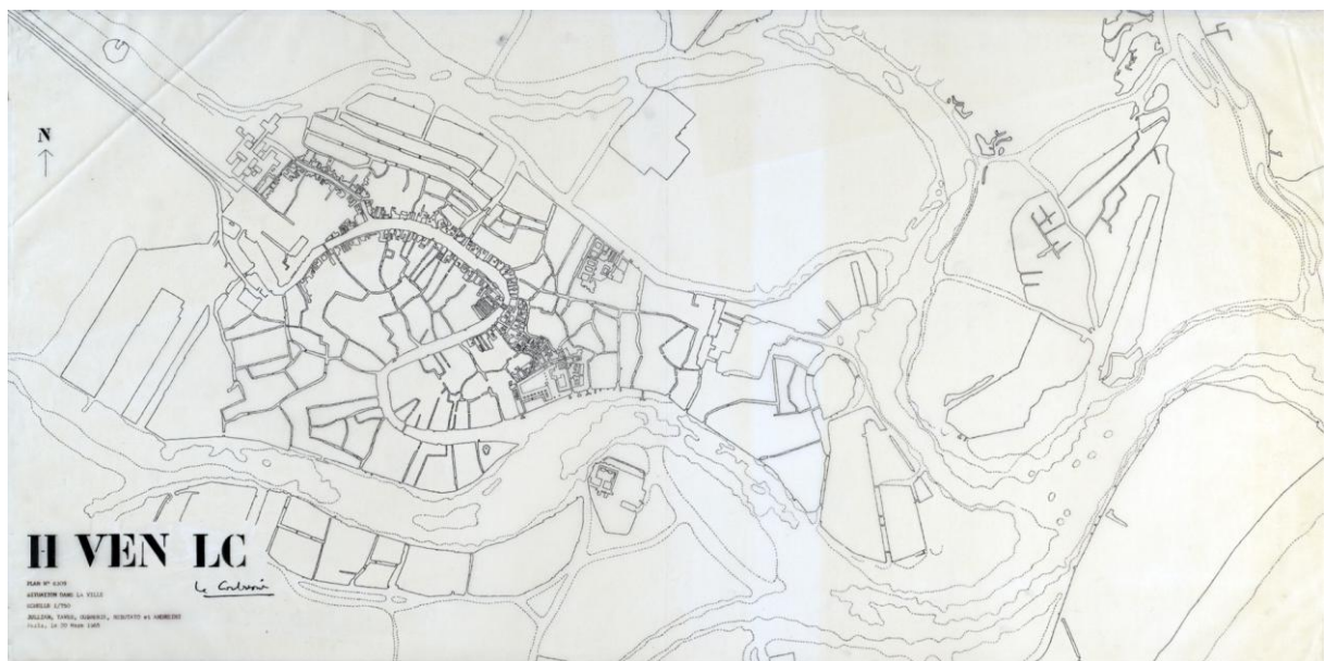
5. Le Corbusier, Situation dans la ville , Ospedale-pro/03/cartella 3/2, Archivio Progetti Iuav, Venice. © FLC-ADAGP

about its future, and subsequent competitions tried to define it within the larger territorial context. Le Corbusier suggested terraferma as the location for the new Hospital 62 , but given administration's preferences for the center, he decided to assume the historical urban tissue as a generative element of his proposal. This decision, only partially retraceable in projects presented for the above mentioned competitions, framed the "problem of Venice" within its insular dimension. In other words, Le Corbusier reaffirmed the actuality of Venice within modernity, but to a certain degree also its self-sufficiency within the regional context. As such, the Hospital project is to be understood not in relation to terraferma , but as the counterpart of Saint Mark Square on the North-Western front, i.d. on the area that has become the new access point to the city since the railway bridge was built in 1831. In fact, being seen as "a meditation about the possibilities of architecture in relation to a city fragile and complex as Venice is" 63 , Le Corbusier's project positioned itself in-between the conservative and the modernist front, satisfying the aspirations of both those for whom Venice was to be preserved and those for whom it was to be adapted to contemporary needs.