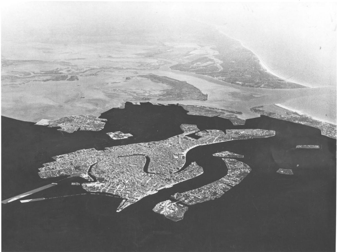
4. Giuseppe Samonà and collaborators, Project for the Tronchetto Island (competition submission) , Trincanato 3. Attività professionale/1/049 , Archivio Progetti Iuav, Venice.

On October 29, 1963, the Municipality of Venice published a notice about another competition - an international one this time - for Tronchetto Island. The notice didn't conform to the rules for international architectural competitions inducing Pierre Vago, the secretary general of the International Union of Architects, to invite planners not to take part in it. Eventually, the notice was changed and the new international competition started on February 27, 1964. The competition notice asked planners "to pay attention to the habitat, to the landscape and to the quality of the view for those arriving to Venice from terraferma" 54 . It seems that with competitions for a new Hospital on one side and for Tronchetto on the other, Venice was determined to refurbish its main facade in a modern fashion but, again, no clear or definitive result was achieved: five proposals were awarded and one special mention was assigned. Moreover, due to certain freedom of interpretation that the notice left to competitors, planners presented very different proposals thus creating difficulties during the judging phase 55 .