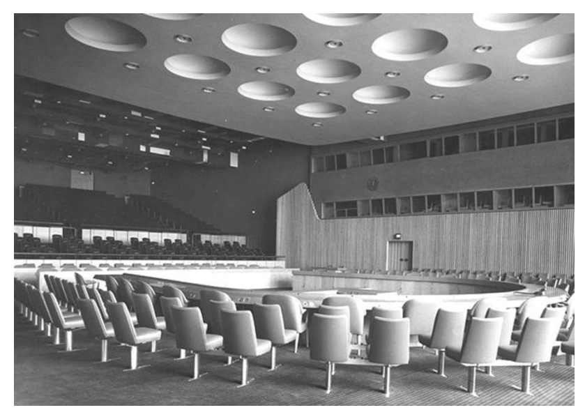
6. Sven Markelius' meeting room for United Nations, 1947-52.