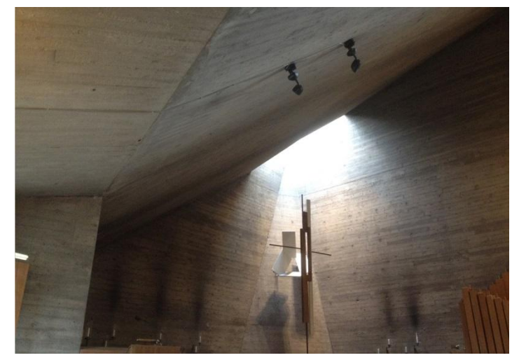
1. Interior of Västerort Church in Vällingby designed by Carl Nyrén and Bertil Engstrand, 1956.

Many forms proposed by Le Corbusier were adopted in Sweden and adapted to the emerging needs of a society that increasingly demanded equality at all levels, as reflected in the Social Democratic government that came into power in 1932, and embraced environmental design as a means to achieve higher living standards. Current socially inclusive designs may find a resource in these Swedish experiments.