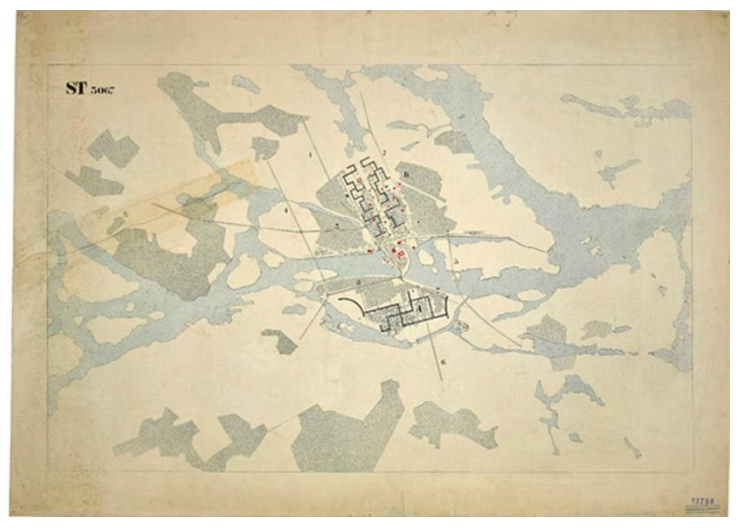
5. Le Corbusier's urban plan of Stockholm for the Nedre Norrmalm competition of 1933.

proposals should aim to give " a clear and logical expression to the role of the district as a commercial centre ," encouraging the opening of Gustav Adolf Torg Square northwards.<sup>29</sup>