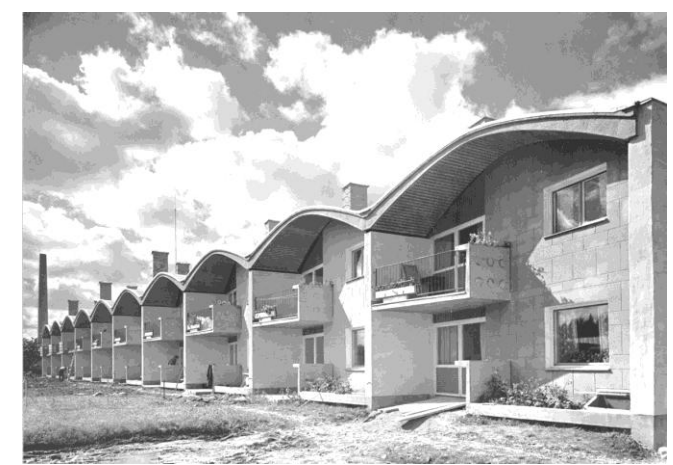
10. Ralph Erskine, row-houses in Gyttorp, 1945-55.