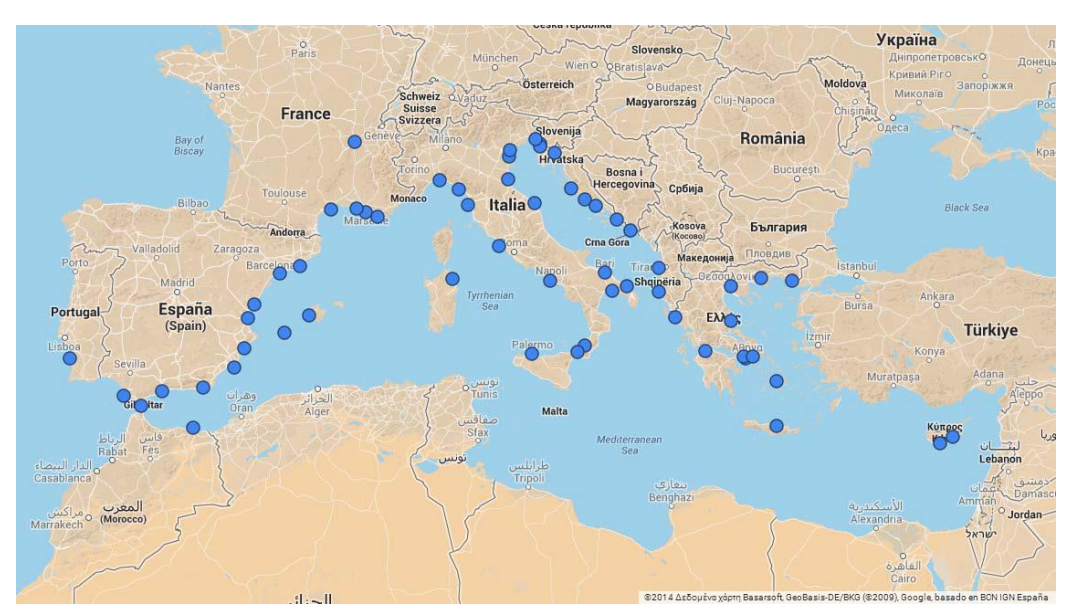
Fig 1. Map with ports analysed

With this idea in mind, a comprehensive list of current practices that could be labeled as good or best practices in 60 ports from 9 countries from the Mediterranean were identified. The goal of this paper being to divulgate the findings made, digest the practices and look for an hypothetical connection between their implantation and the current performance of ports with the aim to identify the best practices that are necessary in any 'ideal port'. To do so the paper proposes a set of key performance indicators (KPIs) and links the values obtained with the level of 'good-practicing' of each port by using a DEA (Data Envelopment Analysis) model.