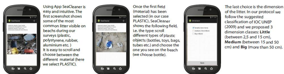
Figure 1. Application SeaCleaner, developed with the aim to be extremely "user-friendly" following Guidelines of UNEP/IOC-“Quick poll” case (Cheshire et al. 2009). Added value is identified in the ease of acquisition, management and storage of data directly into electronic format and stored on Remote Server. The final layout is not yet ready, but here we can show how it would appear once completed in all the graphical part.