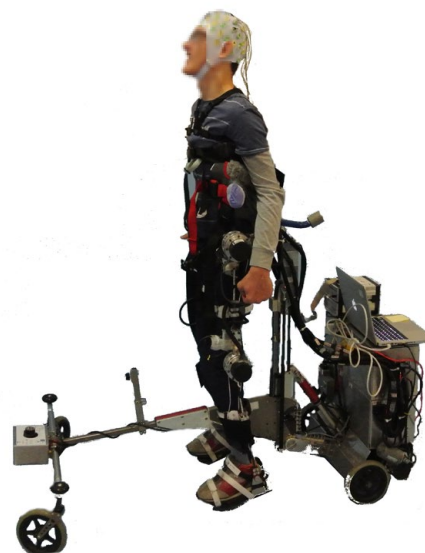
Figure 2. Prototype of the CPWalker robotic platform and the exoskeleton designed for the platform.

promoting the earlier incorporation of CP patients to the rehabilitation therapy, increasing the level of intensity and frequency of the exercises, and enabling the maintenance of therapeutic methods on a daily basis leads to significant improvements in the treatment outcome.