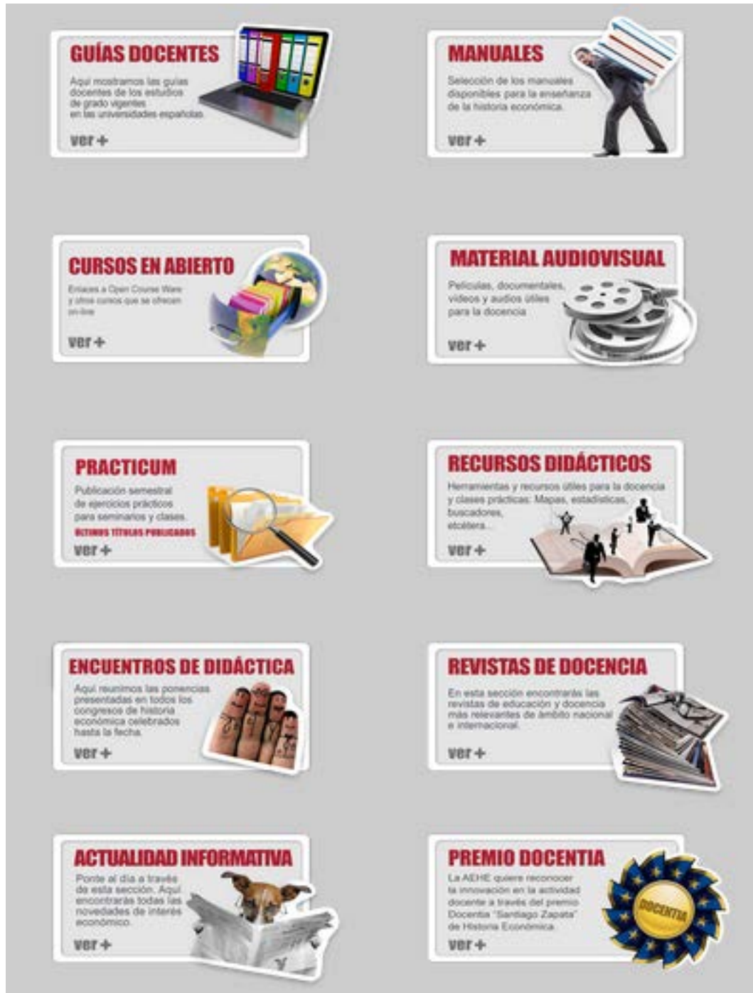
Figure 2. The Teaching Section , Spanish Economic History Association

lecturers. Figure 2 shows the main organisation of the Teaching Section . First, GUÍAS DOCENTES include the available course syllabus across Spanish universities by region, whereas MANUALES provides information on the main textbooks by subject. The front cover and index of these textbooks have been scanned and uploaded as guidance for prospective teachers. CURSOS EN ABIERTO and MATERIAL AUDIOVISUAL is a collection of online courses, videos, films, and pictures related to economic history. MOOCs have also been included in the former one.