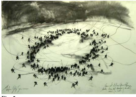
Fig. 4. Film affiche for Berbaoc (various artists, 2008). Fig. 5. Gustavo Díaz Sosa's original drawing for Berbaoc .