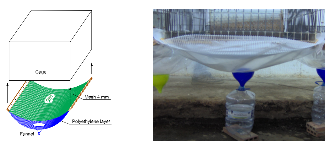
Figure 1: Schema and photo of the urine and faeces collecting device.

separately using a 4 mm mesh for faeces and a lower polyethylene layer collecting the urine into a 8 L bottle (see Figure 1). The device was easy to assemble and dismantle, but labour-demanding, since frequent weighing of faeces and urine was required.