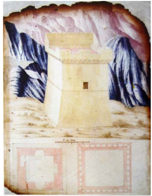
Fig. 1- Torre Vigliena (Maurici, 2008)

document wrote by the Deputazione in 1717, this tower is defined as a Torre di Deputazione and is under the jurisdiction of the marquis of Santa Croce.