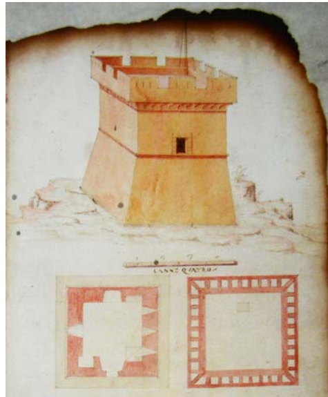
Fig. 2- Torre di Mezzo (Maurici, 2008)

1,60 mt wide; this kind of corner masonry proceed for the entire height of the tower. Between the scarp wall and the first floor there was a roundish cornice 0,30 mt wide, still visible on the North-West side and partially on North-East side. From the remains one can see that the ground floor was divided into two equals rooms by a wall of a large thickness. Actually, despite the growth of urban settlements, from the site is still possible to see the two adjacent tower Scalambri and Vigliena.