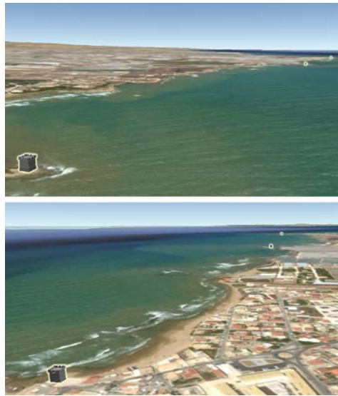
Fig. 4- Google Earth screenshots (Frasconi, Mancuso, Pasquali, 2015)

sizing of individual towers defined on each building depending on the morphology of the site. Camilliani proposes the size and position of every single tower, following the analysis of the surroundings, the peculiarities of the site and the strategic importance of the portion of the coast, linking it to the traditional knowledge of the time and the Portolani. With the proportions derived from the measurement of the sides of the plant, we get the guidelines of the project. These will determine wall thickness and proportion and qualification of the elevations.