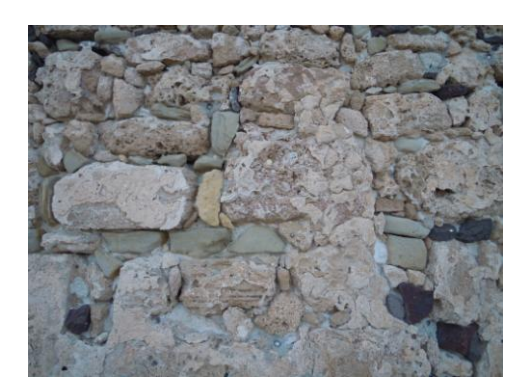
Fig. 10- Residual plasters