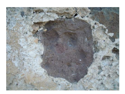
Fig. 8- Andesitic stones into bedding mortars

Original mortars in Coltellazzo tower are difficult to identify because of the massive presence of modern mortars used in recent restoration. In addition to Portland cement (Fig. 11) were used at least 3 types of modern restoration mortars. However the original mortars were sampled and divided into three main types: 1) ashlar bedding mortars (Fig. 8), 2) arriccio/rinzaffo layer plasters, 3) finiture layer plasters (Fig. 9). All the mortars have exclusively a binder with lime composition with occasionally presence of lime-lumps. However, the mortars show a medium-high degree of