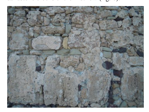
Fig. 5- First row of sandstone block

made through the use of a 80% of blocks of andesite with size up to 50 cm, 15% of sedimentary rocks in blocks up to 30 cm and 5% of granitoids with predominantly subspherical forms probably attributable to fluvial blocks. In sloping walls used lithologies are the same than the basement but there is a higher frequency of use of sandstone (80% of the blocks) 15% volcanic rock and a 5% of granitoids. It should be specified that in the sloping walls there is the presence of a first row (fig. 5) of square and worked sandstone blocks (side about 40 cm) coming probably from the dismantling of an earlier building in the neighboring area of Nora. Over the first row until the light room instead it detects a chaotic presence of irregular stone blocks dimensionally and unworked whose size is about 1/5 of the sandstone blocks of the first row (fig. 6).