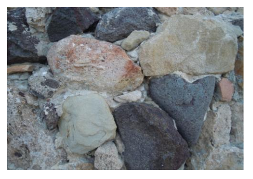
Fig. 6- Andesites, granitoid rocks and sandstones in a external wall

materials. For example, are used for cavea of the Roman theatre of Nora (Melis and Columbu, 1998), near to the tower, extracting from volcanic structure of "Su Casteddu", north of Pula city.