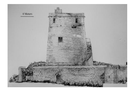
Fig. 2- Coltellazzo tower's perspective