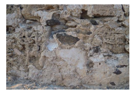
Fig. 9- External plasters

cohesion. The mortar aggregate consists mainly of quartz and feldspar crystals, and andesitic clasts with variable size that in the bedding mortars arrive to about 15 mm. Binder/aggregate ratio of ashlar bedding mortars sampled is variable (range: 0,3-0,7). In the plaster the binder/aggregate ratio is approximately 0,4-0,8.