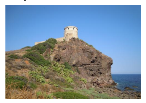
Fig. 1- The Coltellazzo tower

techniques for mineralogic-petrographic and physical characterization. This article also contains geological and geomorphological information of area's building construction and the origin of the materials used.