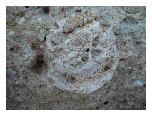
Fig. 7- Macrofossils in tyrrhenian sandstones

feldspar and quartz. This rock is present in the high mountains northwest of Nora and belongs to the Hercynian basement. It arrives in the territory of Nora through some major rivers like Rio Pula and Rio Piscinamanna. The granitoid rocks, when not altered, have a low porosity (<10%).