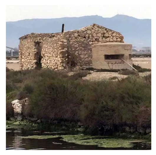
Fig. 3 and 4 - Pillboxes in Saline area in Cagliari