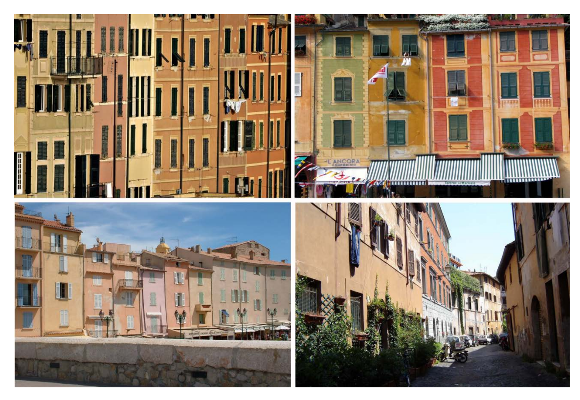
Fig 1. Popular housing throughout the Mediterranean arc are inked with colors arising from the surrounding oxides and lands, creating the existence of a color typical of each city: Camogli (Italy), Portofino (Italy), Saint Tropez (France) and Trastevere in Rome (Italy)

This logical articulation between architectural form, material and color is a common feature to all the Mediterranean coastal countries, in which similar material conditions coincide with an intense network of cultural and commercials exchanges, which led to a similar way of building and a similar way of understanding the city. Therefore, the set of activities developed in Valencia since 1993 is proposed as a valid methodology to be applied in the whole of coastal nations, in order to preserve a common cultural identity which is threatened by intense urbanization processes, often lacking of programs that preserve the original image of urban spaces. [1]