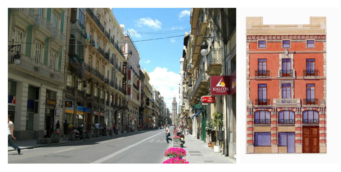
Fig. 8. La Paz Street, and sample of Eclectic building restoration project (XIX-XX)

The visual and color differences between both urban areas are the result of a differential application of similar color ranges. From the technical point of view the material differences between the plasters used in both cases are minimal, almost nonexistent. One thing that is shown in the performed analyzes, besides the incorporation of different materials, is a tendency to smooth the chromatic intensity (ranges 2'5Y, 5Y, 10GY, 5YR, in the case of the Eclectic and Modernist buildings of the late 19th century), a propensity to the visual fragmentation due to the ornamental enrichment and to the conscious search of the polychromy incorporating materials, such as the carpentry, locks and ceramic panels, to the chromatic game. What is noteworthy is that, simultaneously to the increase of the ornamental complexity, there is an increase of the needs for harmonization among levels, so that, to the traditional chromatic harmonization between background and compositional elements, we can add the need to harmonize the background color with the balconies and locks, and to harmonize these last two together.