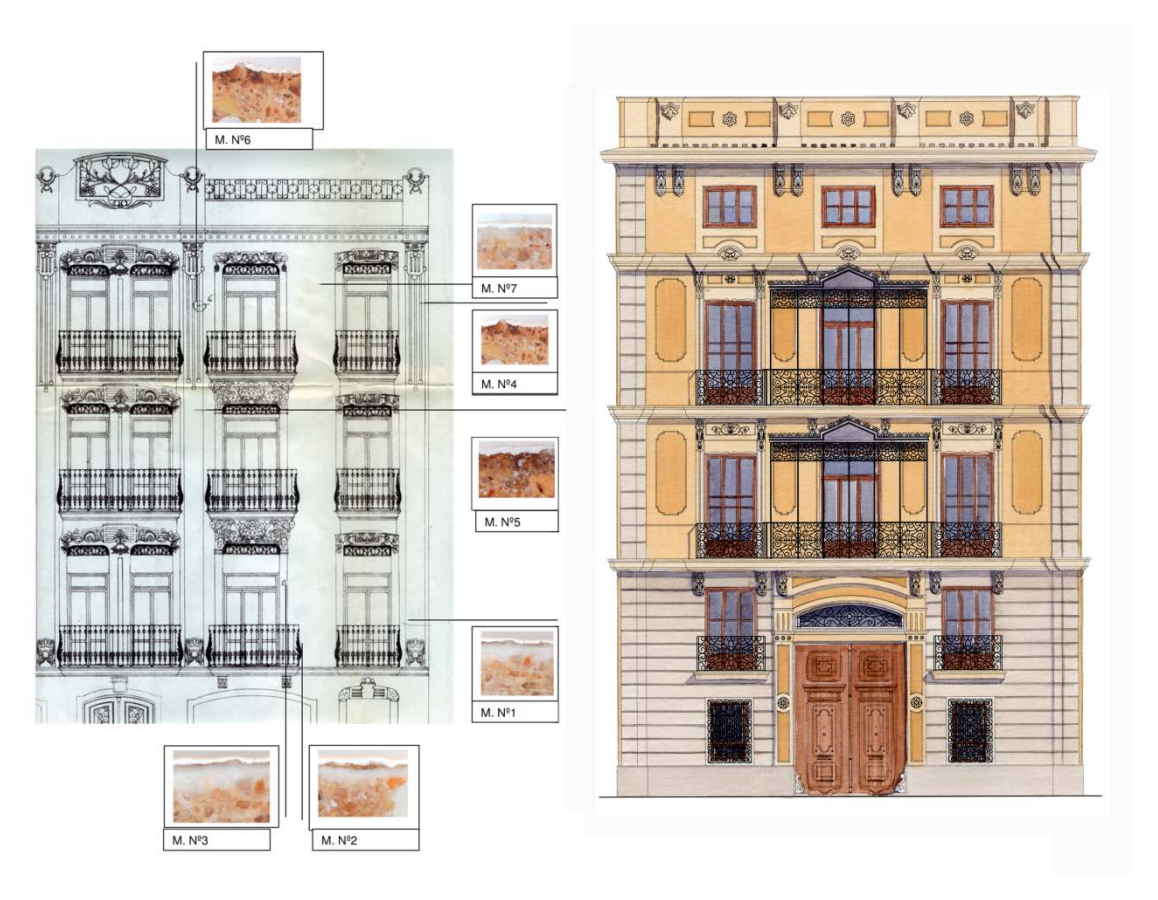
Fig. 4. Chromatic and material study of a facade of the historical center through stratigraphic analysis of plaster samples.

The colored lime mortar used natural pigments, soil and oxides which were extracted from the hinterland close to the city and they linked the images of the city and the territory. This is the origin of the fact of identifying certain colors to particular cities: the ocher of Sienna or the yellow of Naples were created from the natural conditions of the site, generating a two-way relationship that came to assimilate city and territory in the collective imaginary. [8]. It is precisely the loss of this close interrelation between the material from the immediate surroundings and the traditional structural solutions which has generated both, the progressive material deterioration of the Mediterranean historical centers, and the loss of identity and the chromatic and visual artificial uniformity that derive from the indiscriminate use of modern materials. The present study stresses this aspect, proposing not only the recovery of the traditional material characteristics through the use of contemporary structural techniques, but also the link between these material characteristics with the chromatic variables of architectural form and the establishment of implementation criteria aimed to preserve the historical spatial differences of the different areas of the historical city.