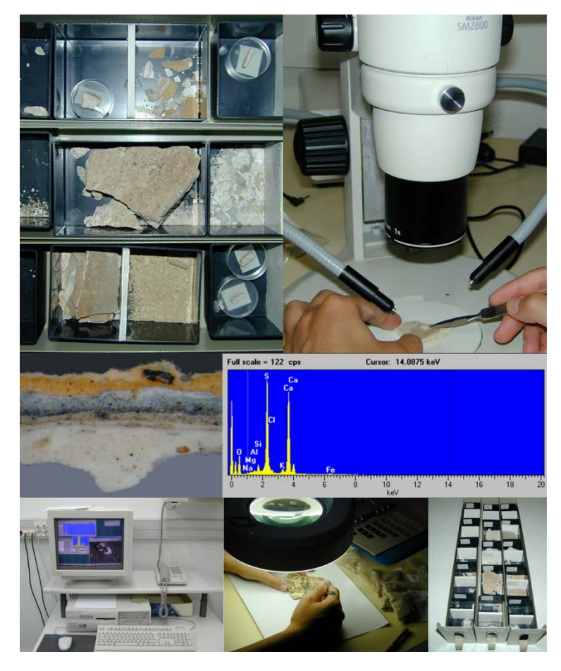
Fig. 3. Sample extraction and analysis to find out the original construction techniques and pigments

The result of the developed studies [7] allows describing the basic construction technology, common to all analyzed historical buildings, with minor variations. In this way we can conclude that in masonry from before the middle of the 19th century, they mostly used air hardening mortars (lime mortar and gypsum plaster) and hydraulic mortars (pozzolanic and hydraulic lime mortars). Relative to repairing mortars, the use of lime, gypsum and hydraulic mortars was usual. The set of developed analysis about the historical center of Valencia give us the following relative values about the predominance of one or another construction technique in historical buildings: [5]