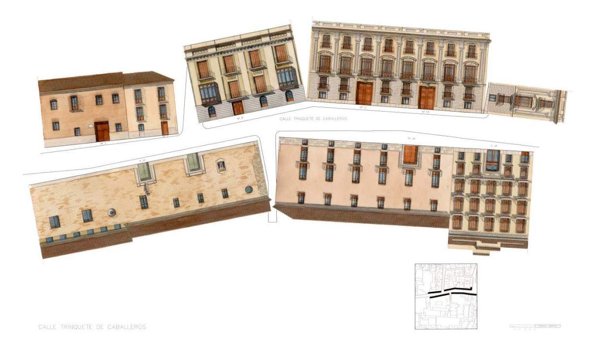
Fig. 6. Trinquete de Caballeros Street: An example of predominantly Aristocratic Buildings

Outside this chromatic continuum, there are 'chromatic exceptions' that characterize specific spaces. Firstly, the special buildings and palaces that use not only colored mortar belonging more or less to the major chromatic families, but also other expensive materials that make them unique and convert them into visual landmarks within the chromatic scheme of the city, such as stone and stucco.