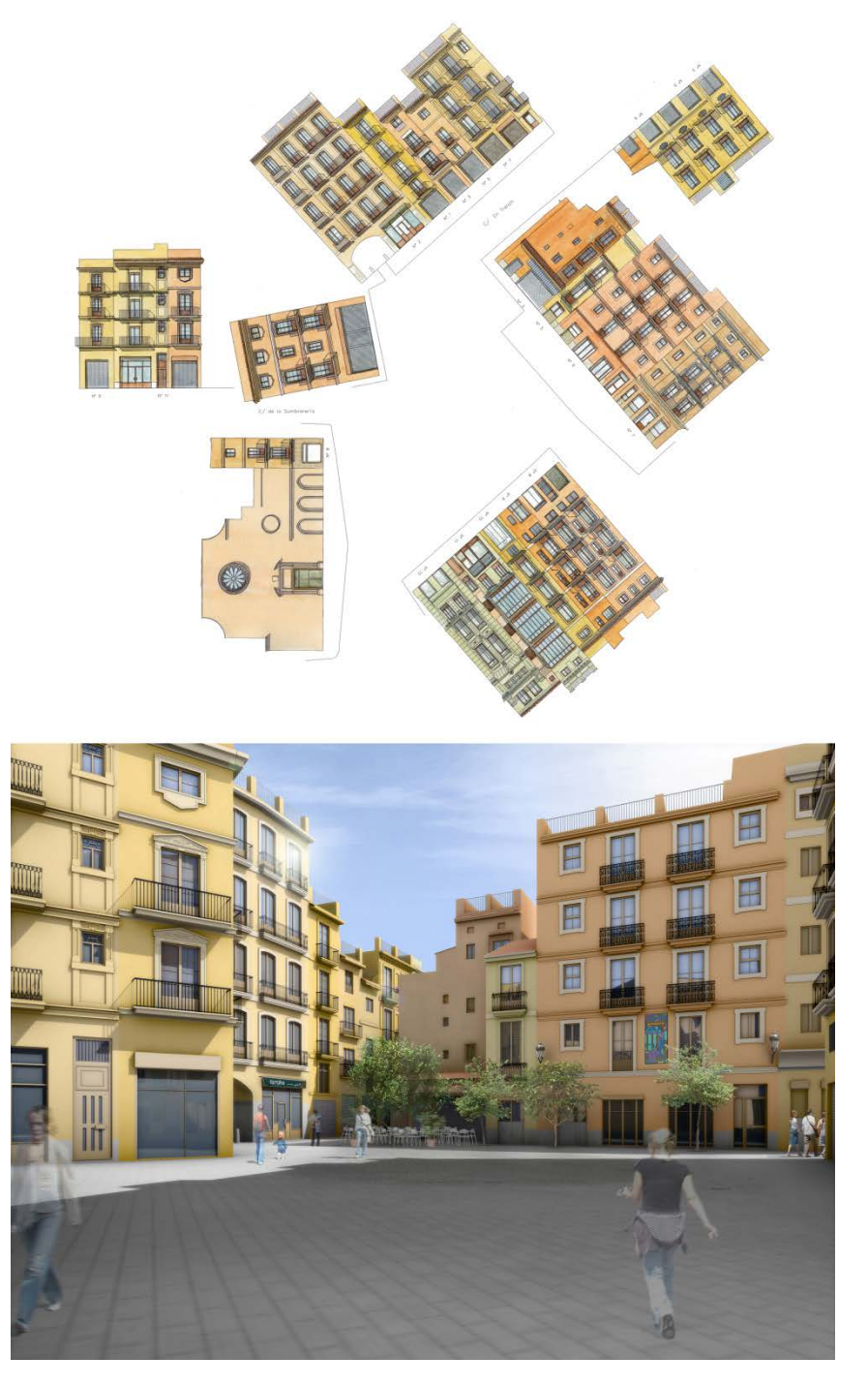
Fig. 7. Lope de Vega square. : An example of urban space with predominantly Artisan Buildings.

degree of visual and chromatic fragmentation, juxtaposing the facade colors in a fast and strongly vertical sequence, since each narrow building adopts a chromatically independent solution. However, this visual fragmentation is joined to some color uniformity due to the use of a limited number of color ranges, which were basically derived from the use of pigments based on natural oxides (5YR, 7.5YR, 10YR and 10R), more economical and readily accessible. So they were appropriate to modest buildings and those with an especially practical nature.