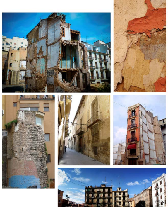
Fig. 2. Urban and architectural degradation in Valencia.

Most of the resident population that remained, excluding those areas in which the Administration and a part of the financial entities settled, was increasingly aging and was economically unable of facing the maintenance tasks of the housing. Those underwent a progressive and unstoppable deterioration. Spacious mural surfaces of the historical center were characterized by a deplorable state of conservation: Walls totally faded or with the color layer so eroded that it was possible to see the previous layer existing under the current one; walls with different layers of paint, all of them chipped, that showed with clear evidence the different colorations that the building had undergone over time; chips in the chromatic finish due to the incompatibility between the paint treatment and the wall: chipped mortars with important cracks due to the age that leaved the nude brick; and bulges and flacking of waterproof paints which had been incorrectly used in subsequent remodelings. All this, added to a profound ignorance about the interaction between traditional building techniques and new materials used in the restoration process, derived in a profound deterioration of the urban image of the historical city, losing the coherence between the original urban space and the formal and chromatic characteristics of the buildings that composed it, producing the loss of the own cultural identity which the city carries